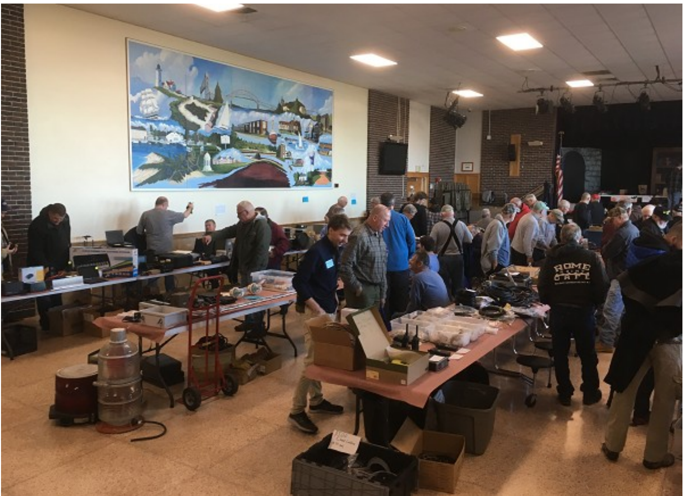
Another fun FARAFEST! Thanks to those that organized this great fall event.