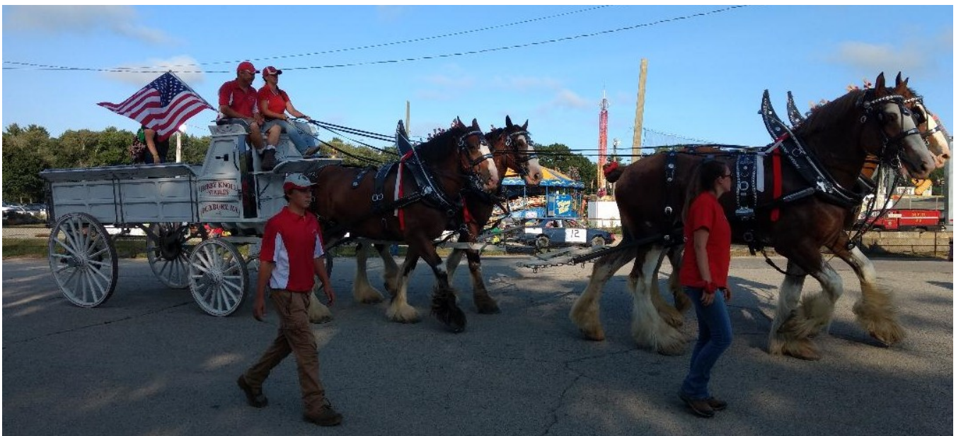
A Marshfield Fair tradition: The Clydesdale horses passing by our booth