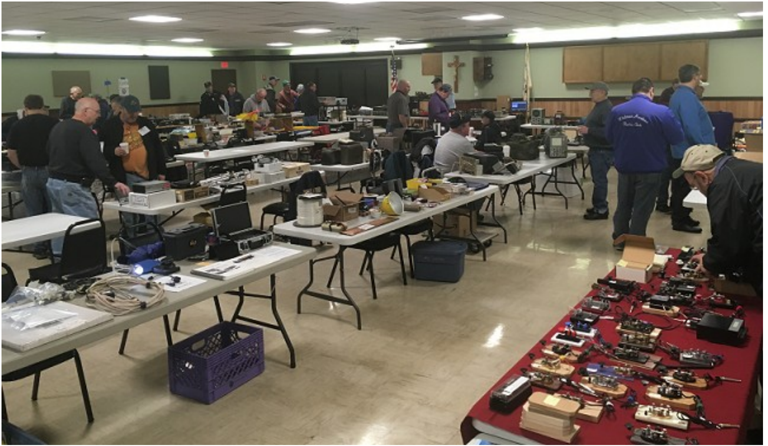
Vendors setting up at the K/X Hall starting at 7am