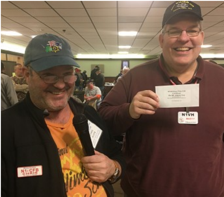
Marty N1VH won a $10 gift certificate from the RF Adapter Guy