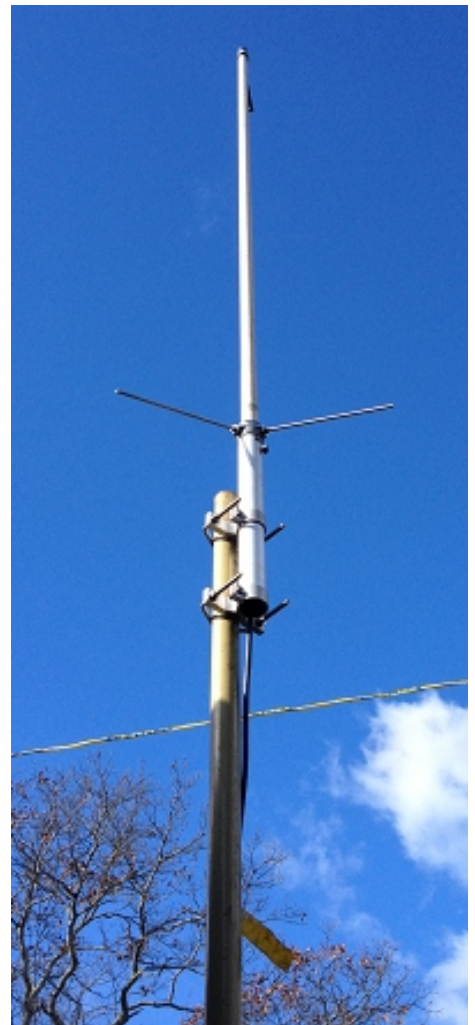
The 2 Meter vertical antenna with the Windom seen in the background