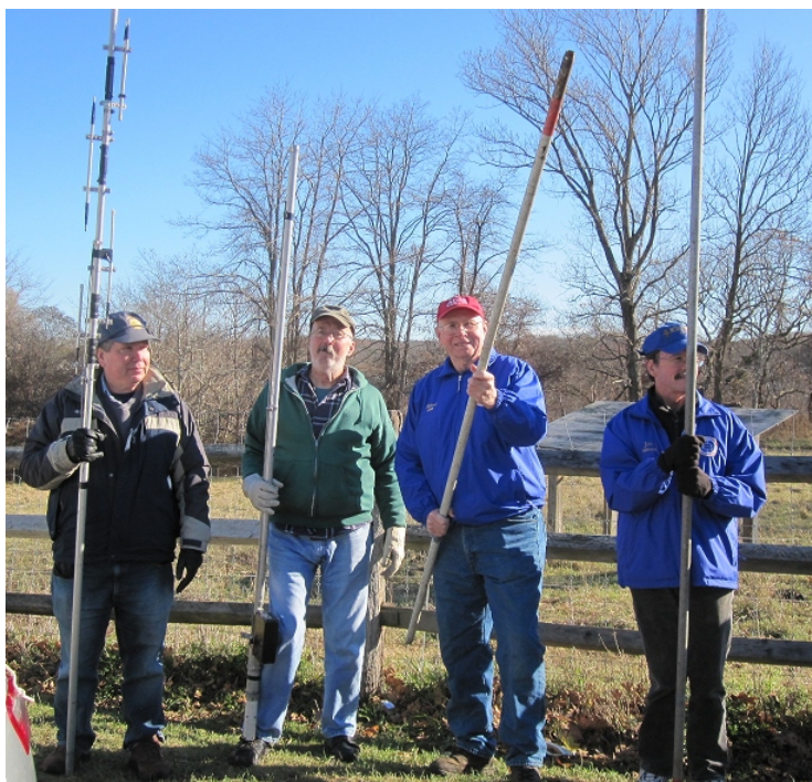
The crew is ready to install the R5 vertical antenna