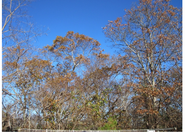
The other end of the Windom into a tree at the north-northeast end of the Admin building