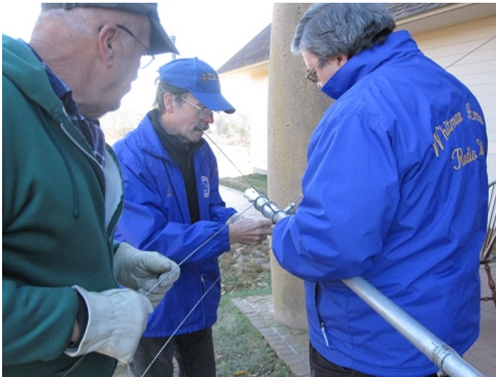
...still putting the R5 together...