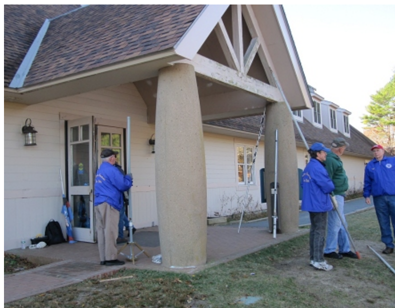
Behind the visitor center, the crew prepares to install the R5 HF and 2M vertical antennas