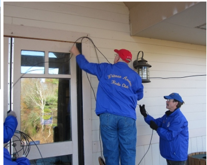
Now routing the coax into the visitor center....