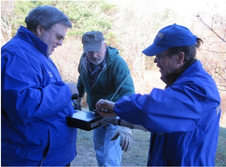
The R5 assembly is underway...