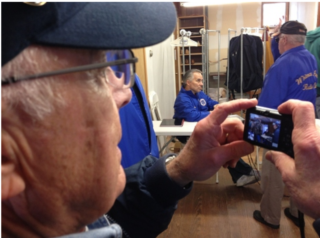
Club photographer Jeff WK1D capturing the event.