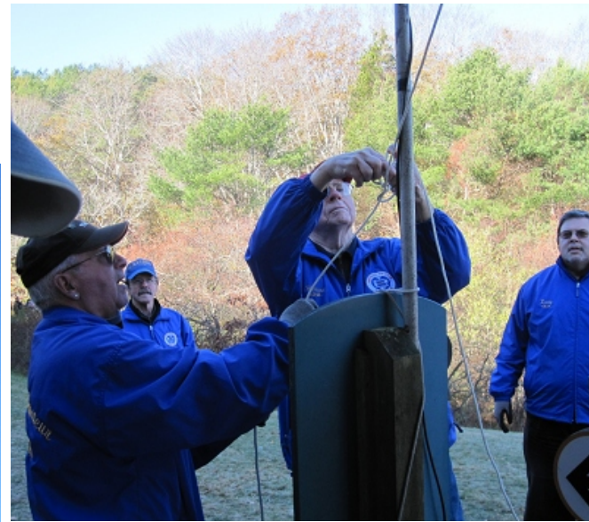
The crew making sure it stays vertical for the weekend!