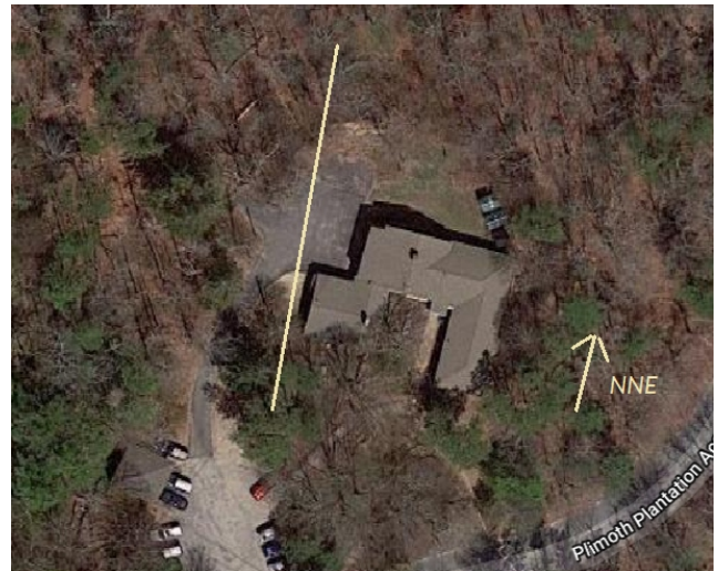
FYI- ariel view of the Admin building and approx position of the Windom antenna installation.