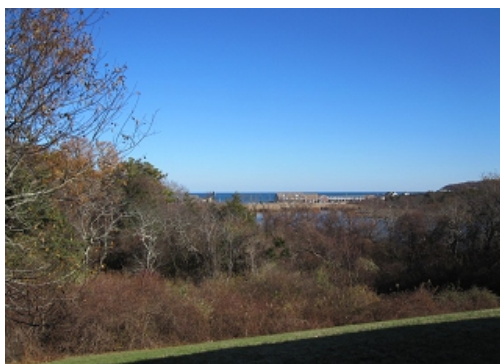
L/R: the view from behind the visitor center looking towards Plymouth Bay