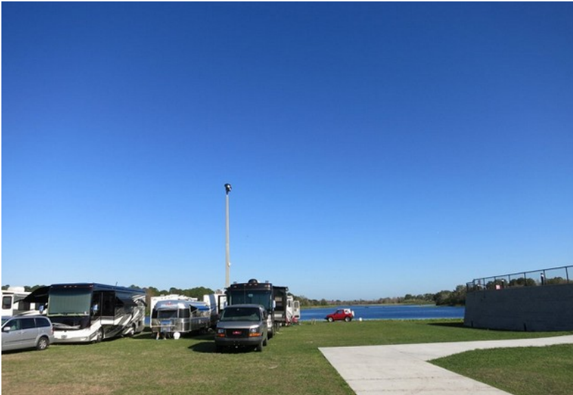
Once you sell all your stuff you can go fishing. This is the 21st day in a row without a cloud. Will we get to 100 days again?