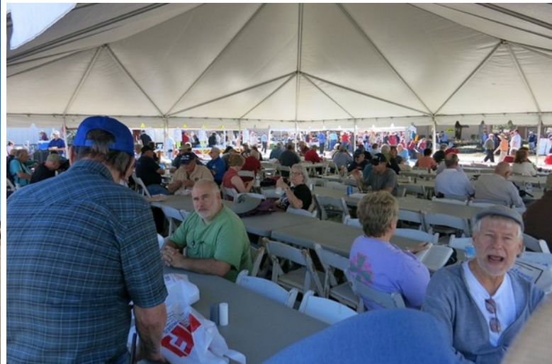
The fellow on the right was saying, "help, I spent all me money". Many places to get some shade.