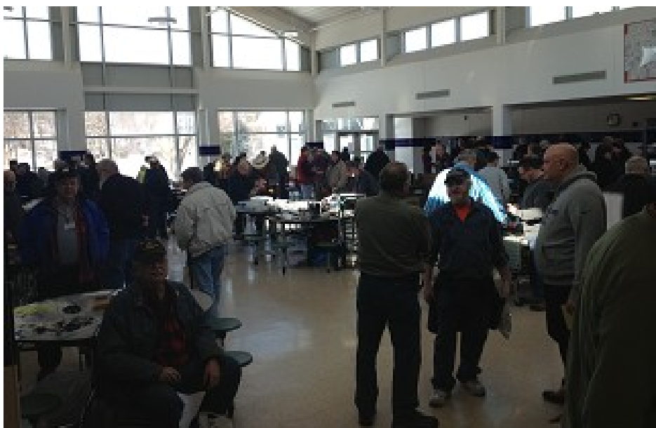
Attendance seemed lower this year...