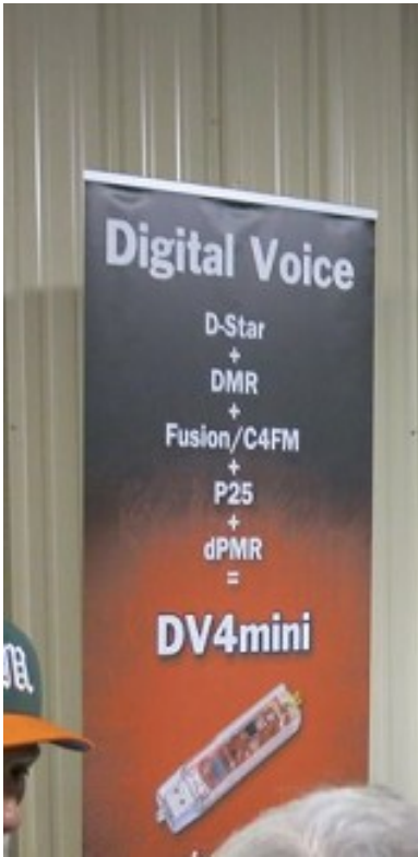
5 digital sources in one box!