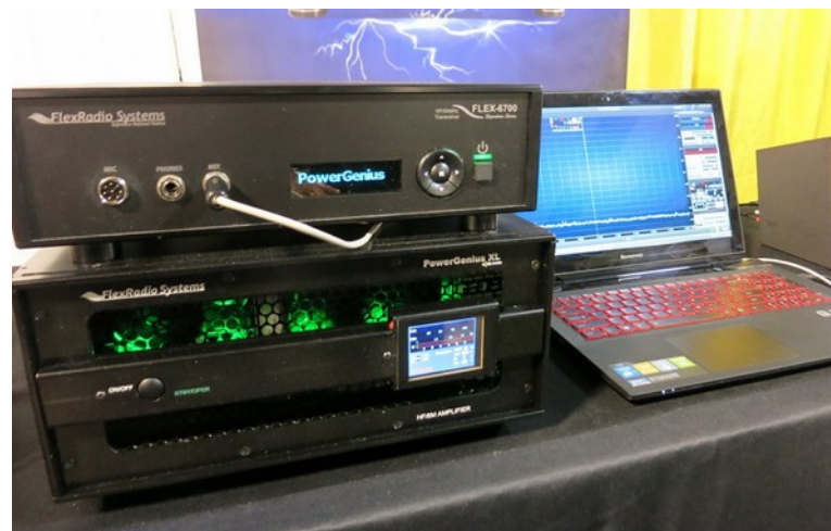
FlexRadio System's new power amp: The PowerGenius XL. They require $1,000 down to hold your place in line! It look like a winner!