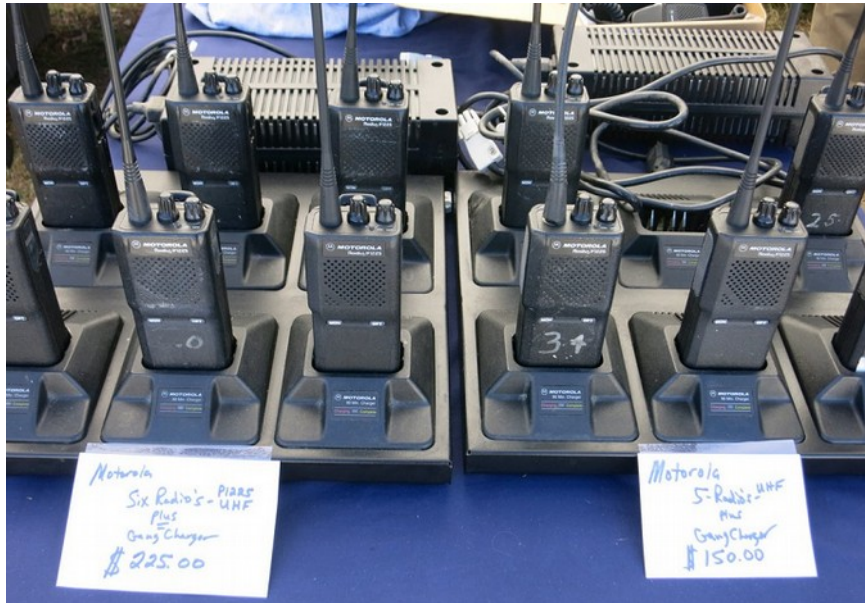
Not sure if this was a good buy. But the DMR walkies were selling for $117 new. DMR is huge down here!