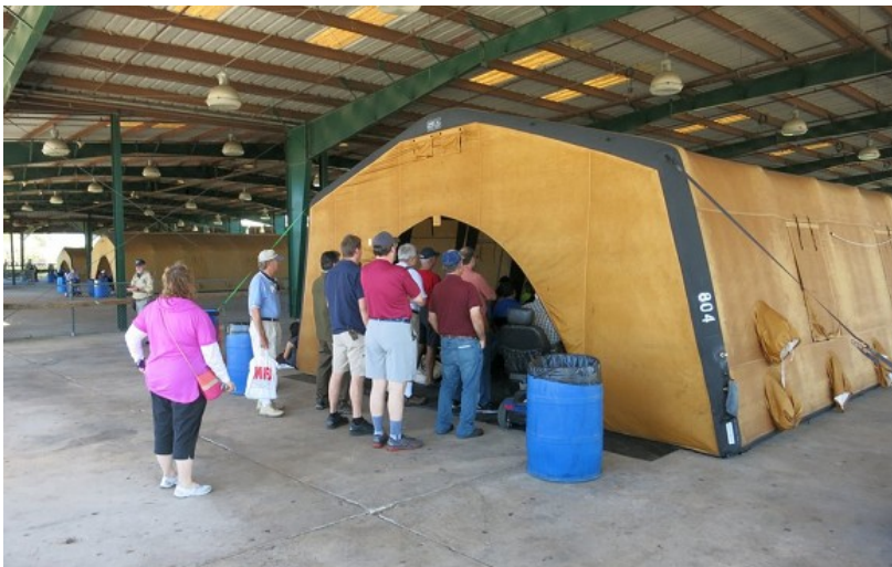
Many lecture tents were set. They were always full

Another great day. Come on down and visit next year!