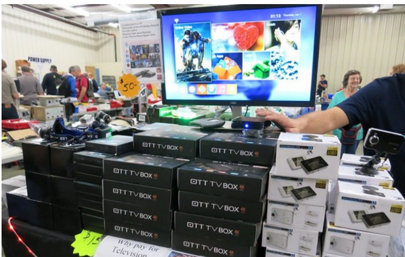
Android Boxs for $50.. Business was brisk