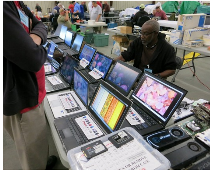
There tons of laptops for sale at very reasonable prices