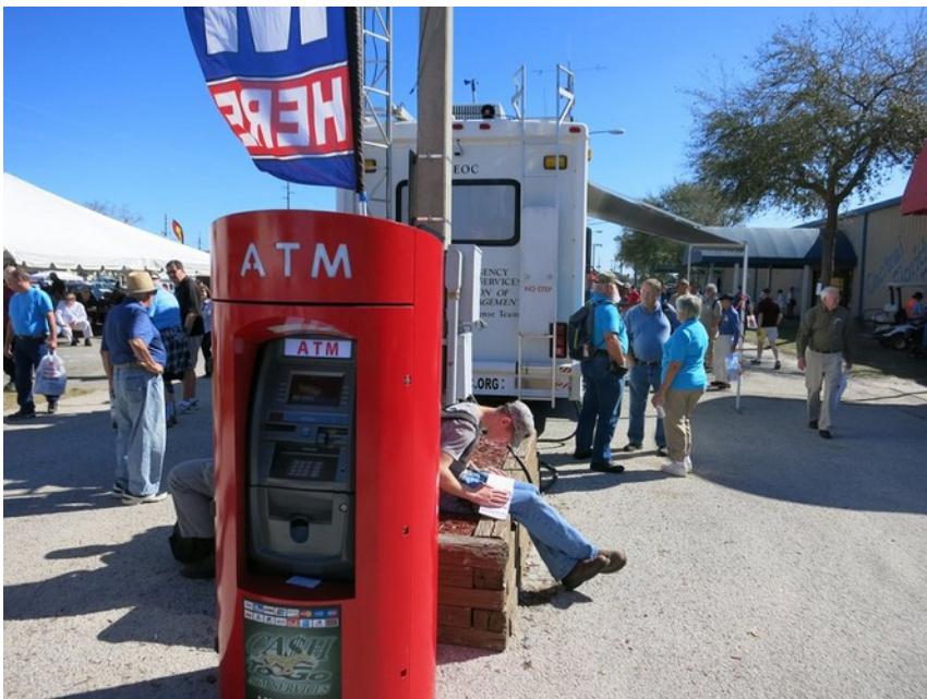
There were 165 ATMs there.....well, not really, but there were a lot. I tried it and it ran out of money before I could purchase my new K3S