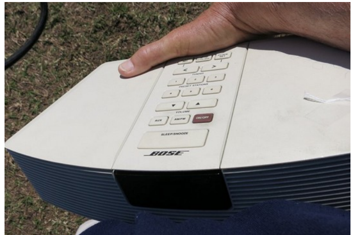
Guess who is holding this...my second purchase