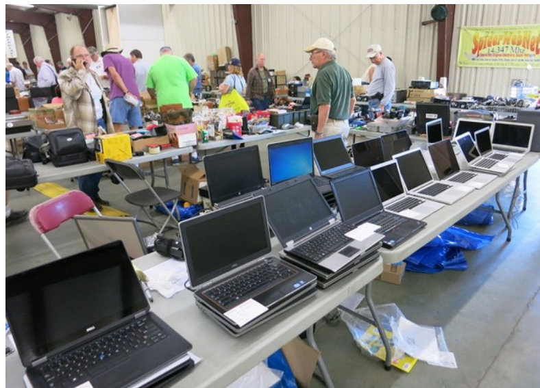
As I said above.....