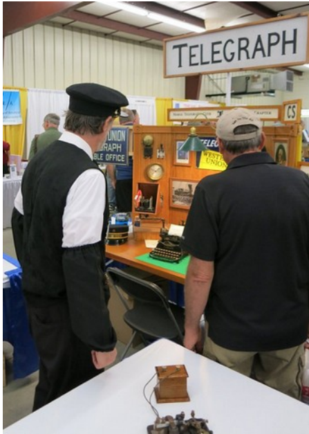
Telegraph? Remember that?