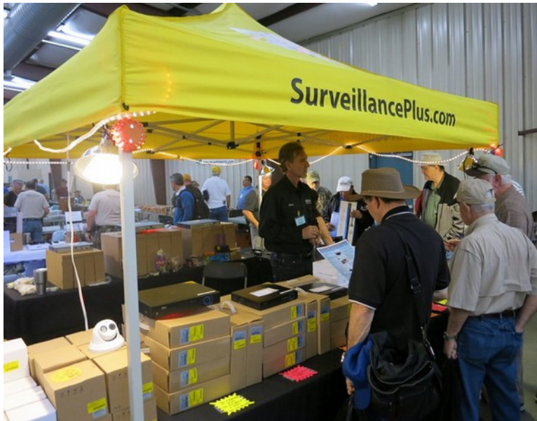
Big Brother's Tent!