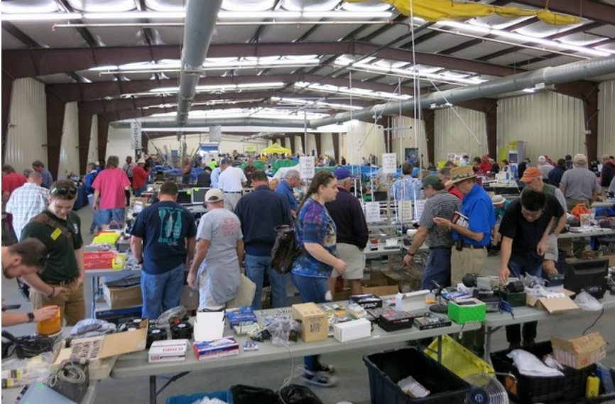
The indoor market was air-conditioned which made for comfortable purchasing!

(fyi, convention details available at http://www.hamcation.com/ )