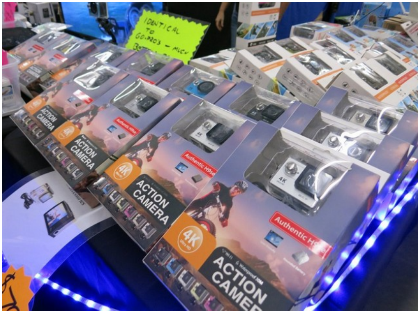
GoPro look alikes for for $75