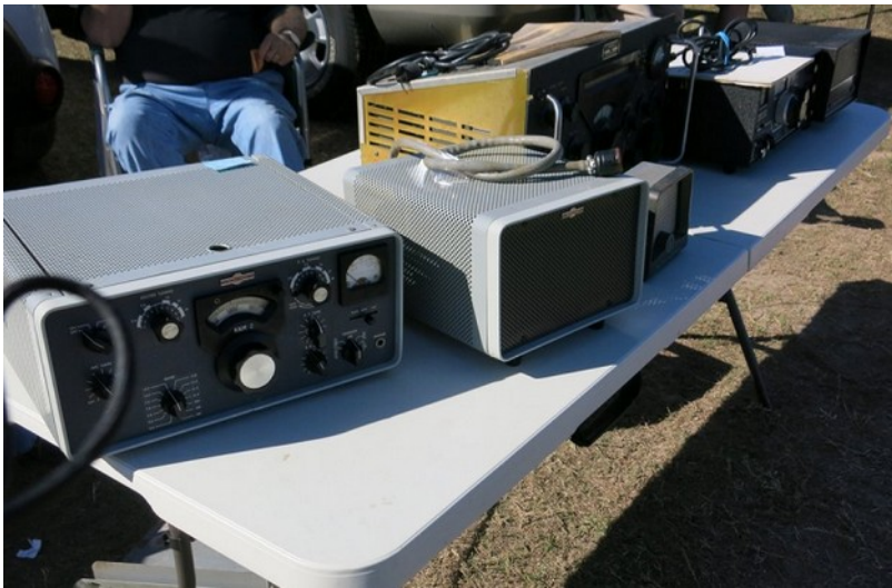
Lots of Collins radios available