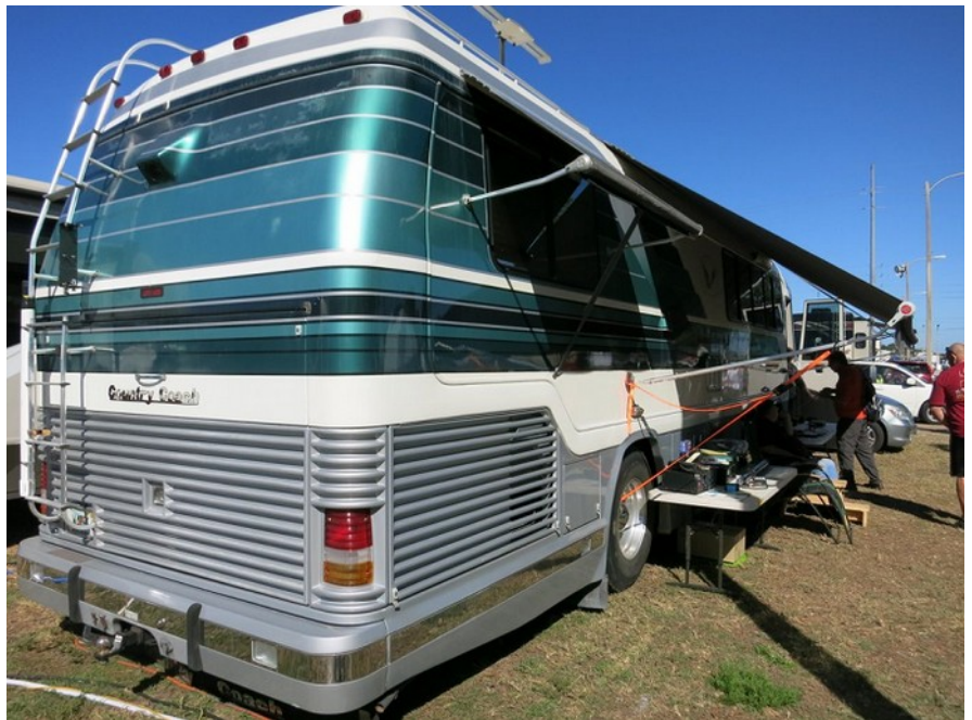
RVs from all over the country. My of these are worth more than my house!