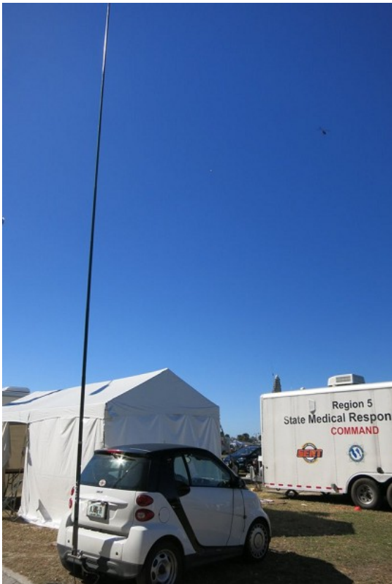
A mobile SteppIR antenna