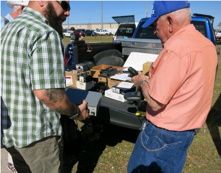
This is real tailgating