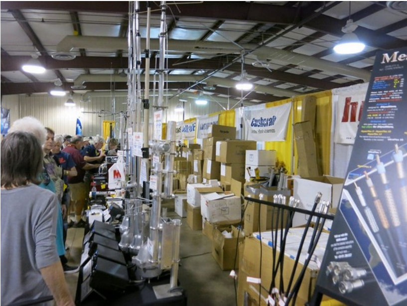
MFJ had the largest booth