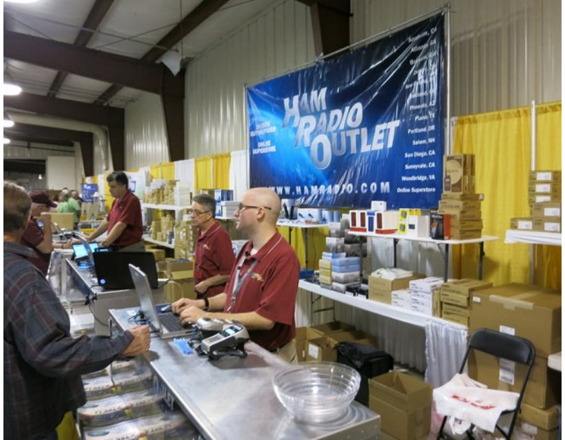
HRO was constantly busy like Dayton