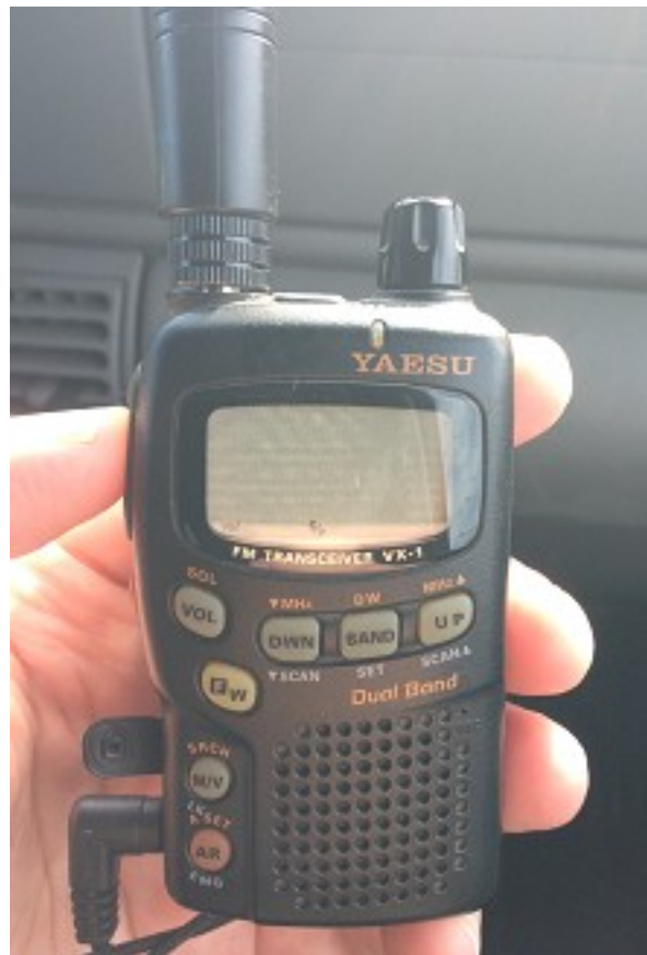
Joe K1JMA picked up a 'micro-miniature' Yaesu VX-1 for only a few $$