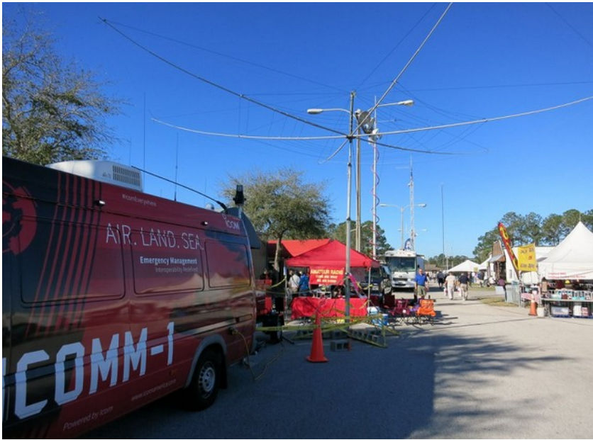
I got there a bit early before the crowds