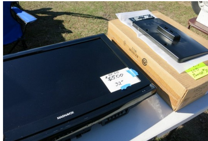
Tons of monitors for sale at reasonable prices