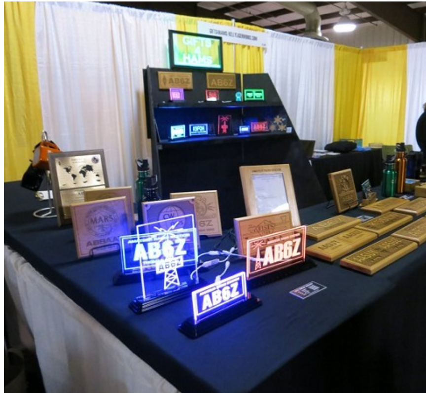
Signs, signs, everywhere signs...