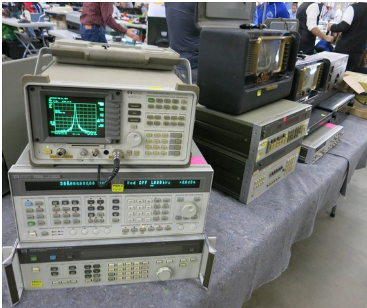
I gave this analyzer a lot of thought!!