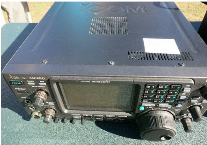
A slightly dusty IC-746PRO for $800