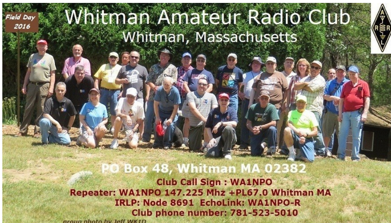
Whitman Amateur Radio Club meeting February 1st, 2017