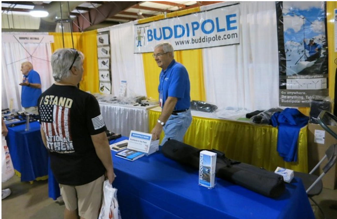
Did not see Bud, but Buddipole was doing a lot of business