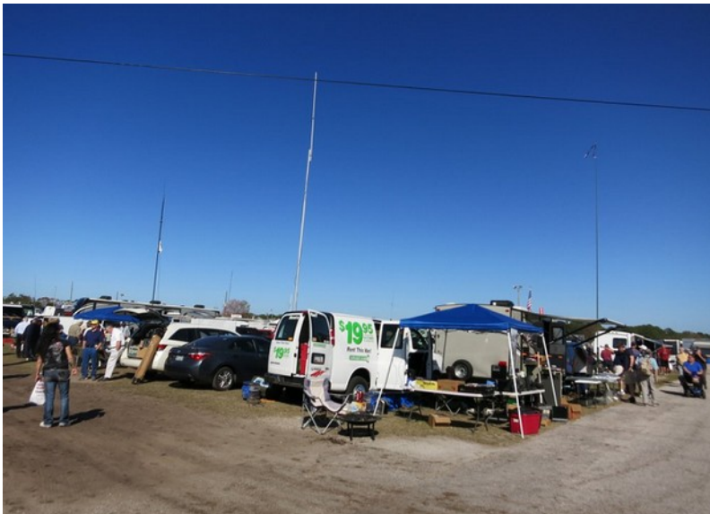
Every road was filled with sellers