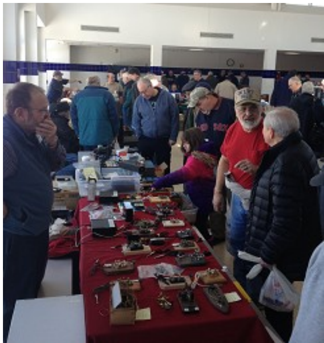
Although there was a crowd near the keys & paddles..