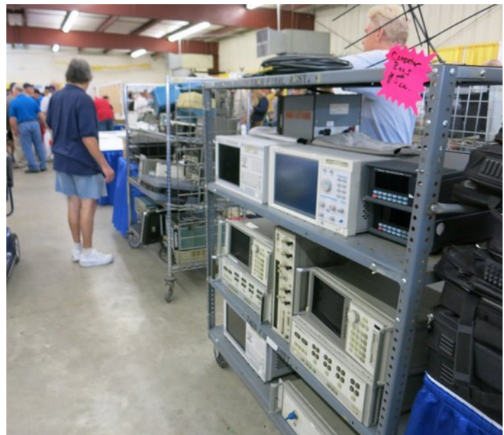
Test equipment galore