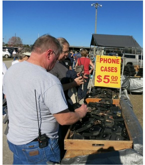
A case for every phone