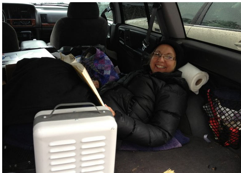
Karen N1VI found a warm (note the white heater), dry spot to curl up with a good book!