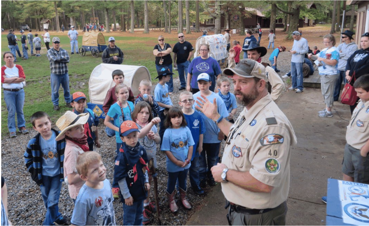
Another group on the way in