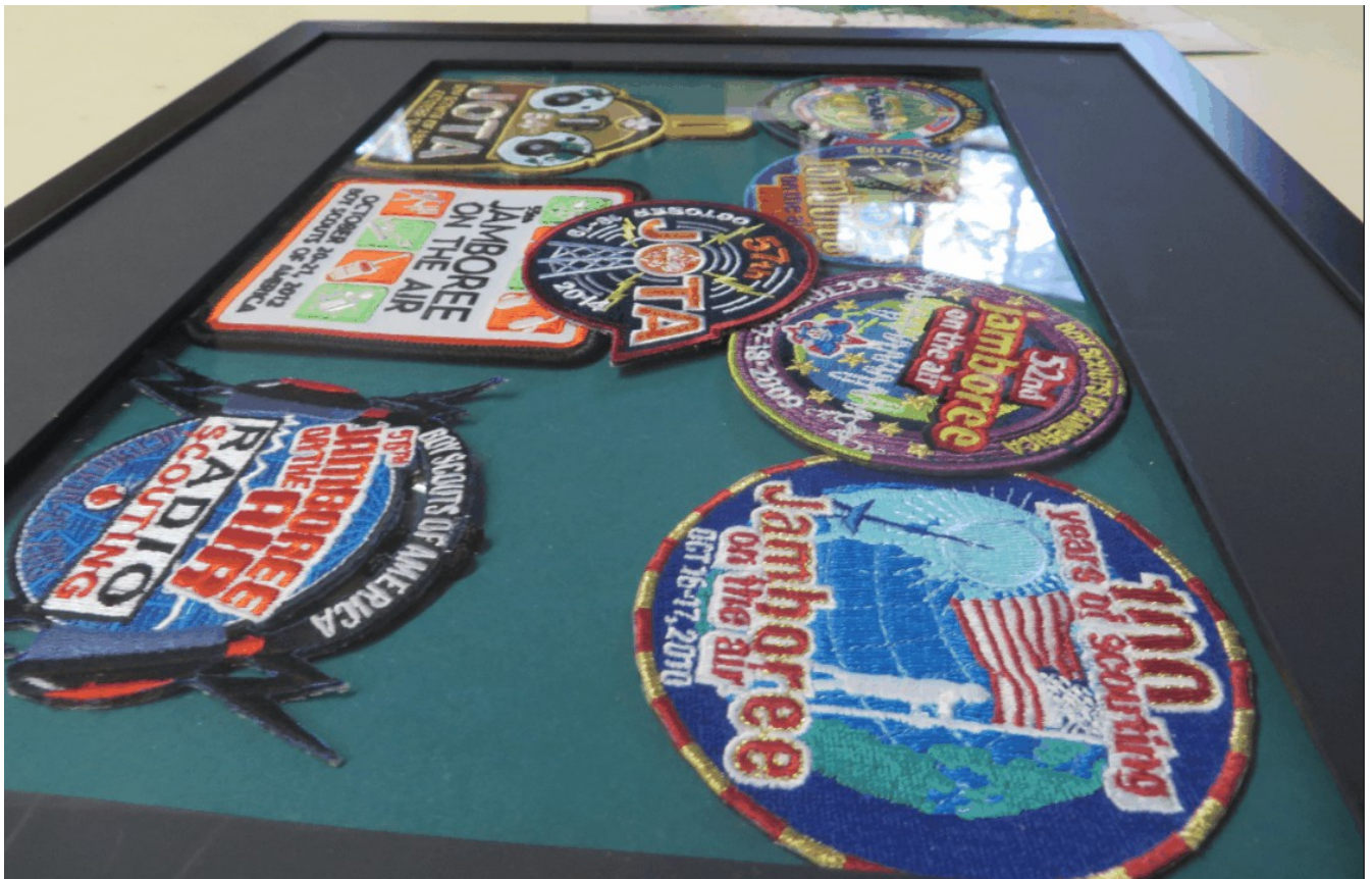
Some JOTA Merit Badges