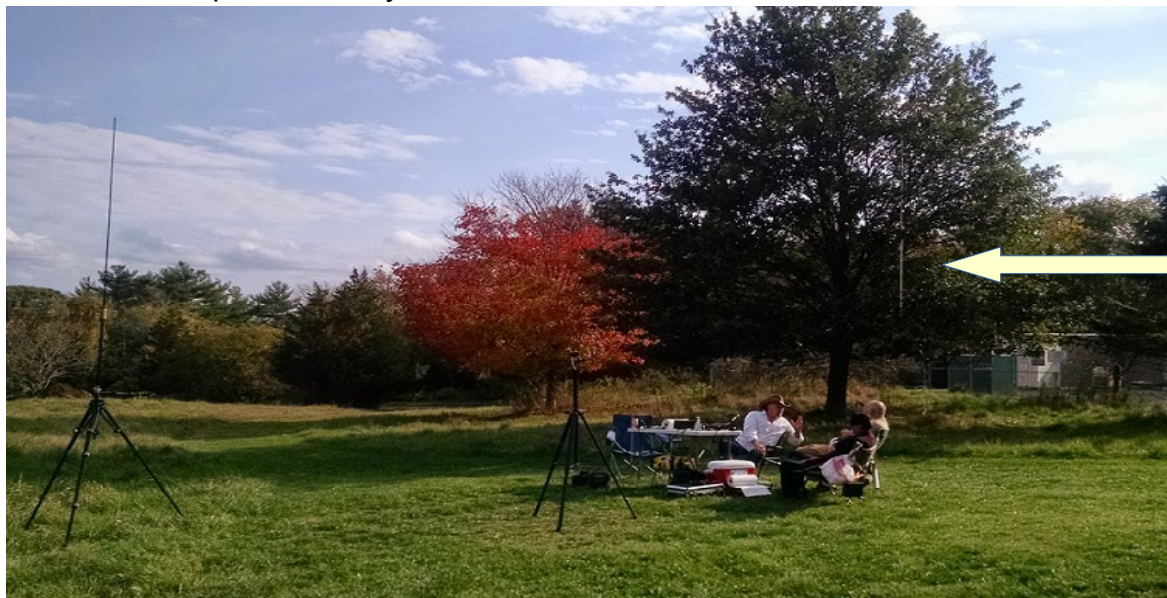
QRP Ops w/both antenna systems in view. The Buddy Stick on the left and the Antron 99 suspended in the tree on the right.