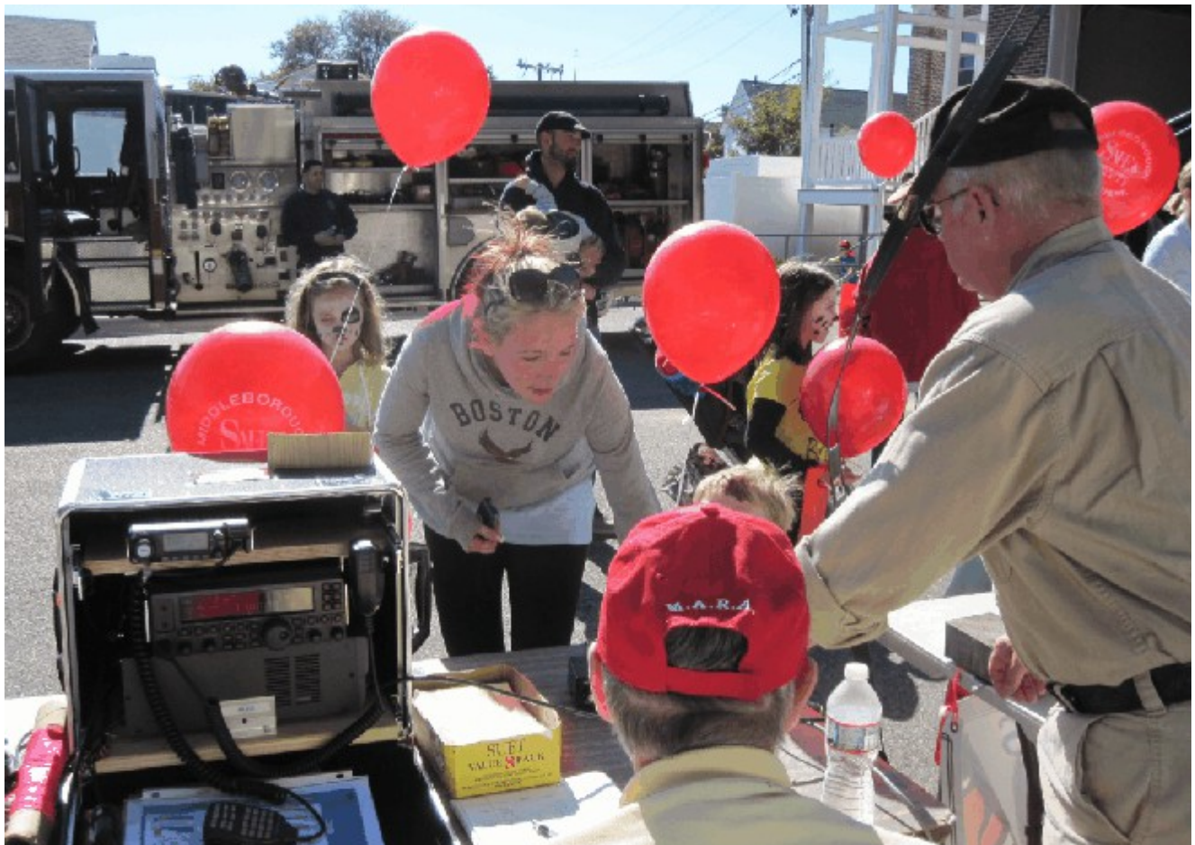
A little Morse Code