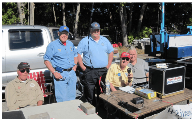
KB1MTW, WK1D, KB1TEE, N1EZH, W1MSP