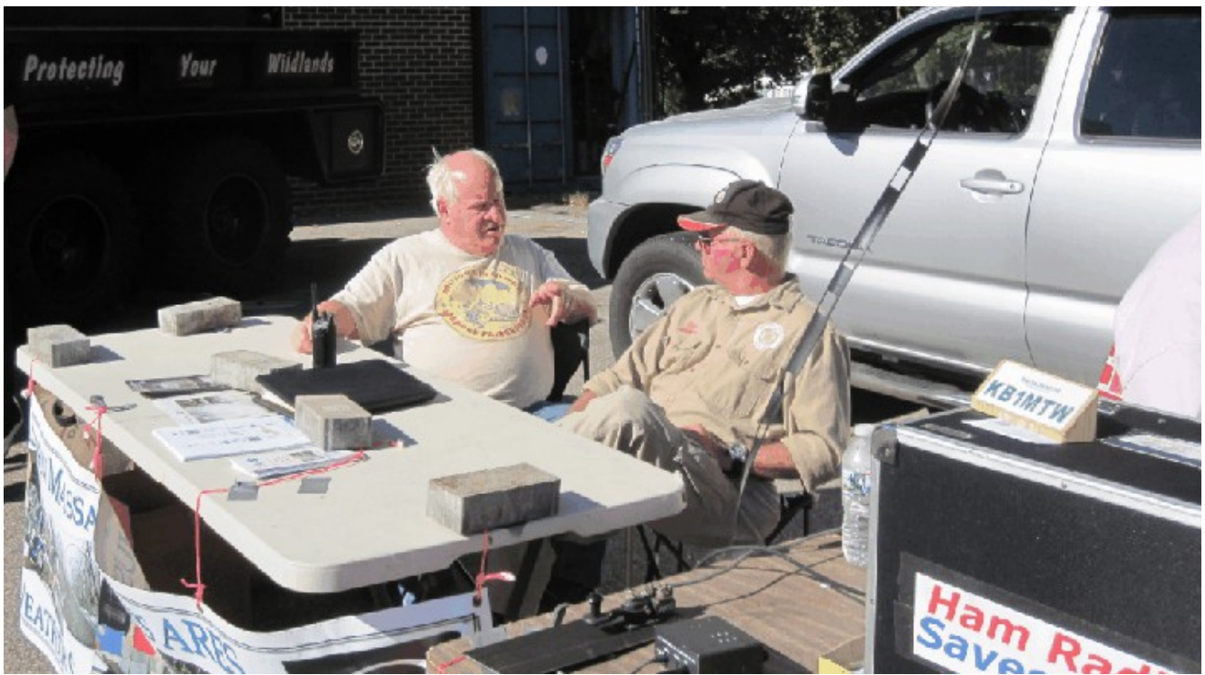
W1GRC and KB1MTW