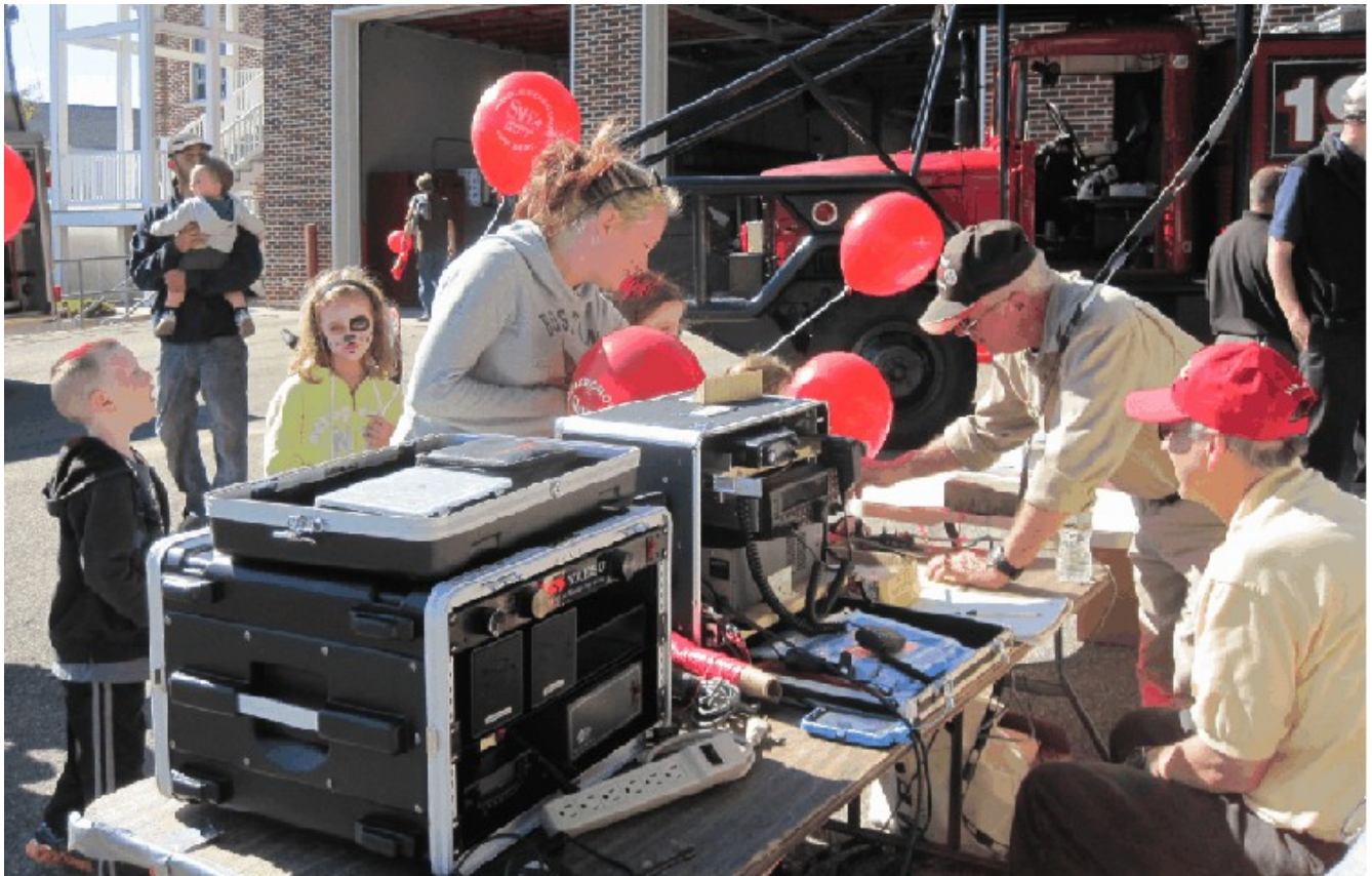
At last! Some customers for the table!