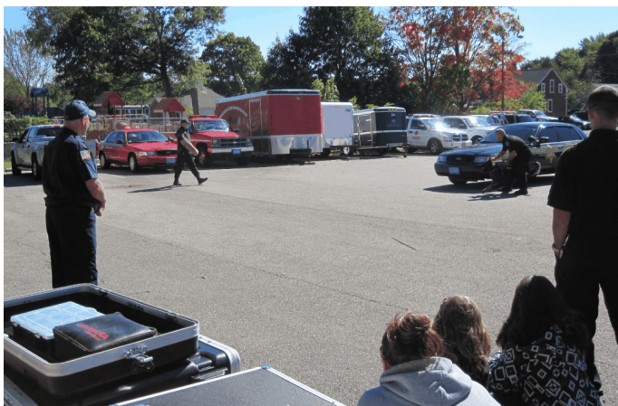
Go catch the bad guy!