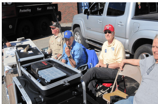
KB1MTW, WK1D, N1EZH, W1MSP