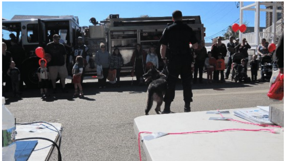
Introduction to Police Dog Work.