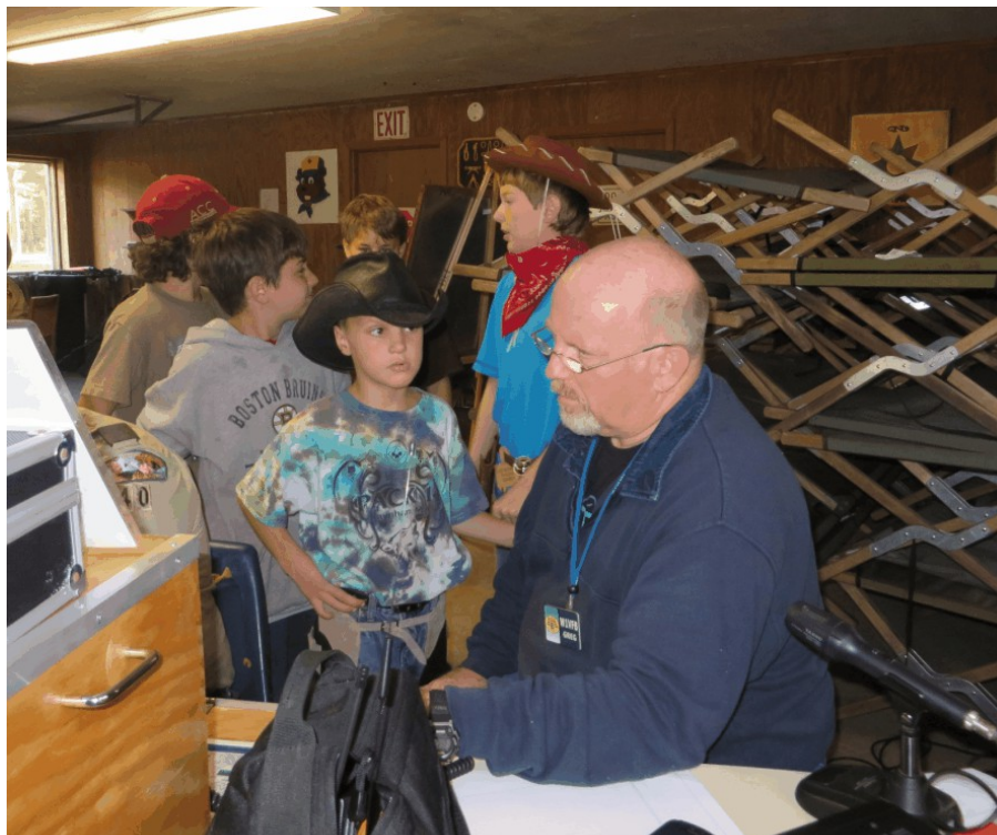
Trying to hear in this room was fun!