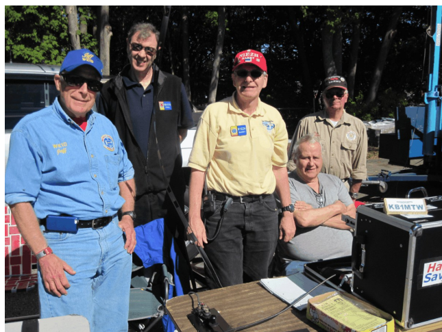
WK1D, KB1CYO, N1EZH, W1MSP, KB1MTW