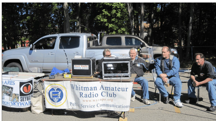
K1UFO, W1MSP, KA1JBE, KC1BBU