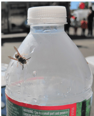
WK1D also had a visitor.