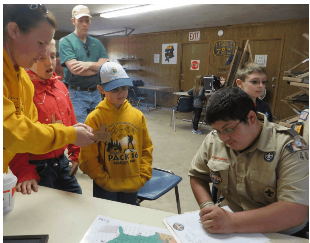
Must get the scout information logged in!