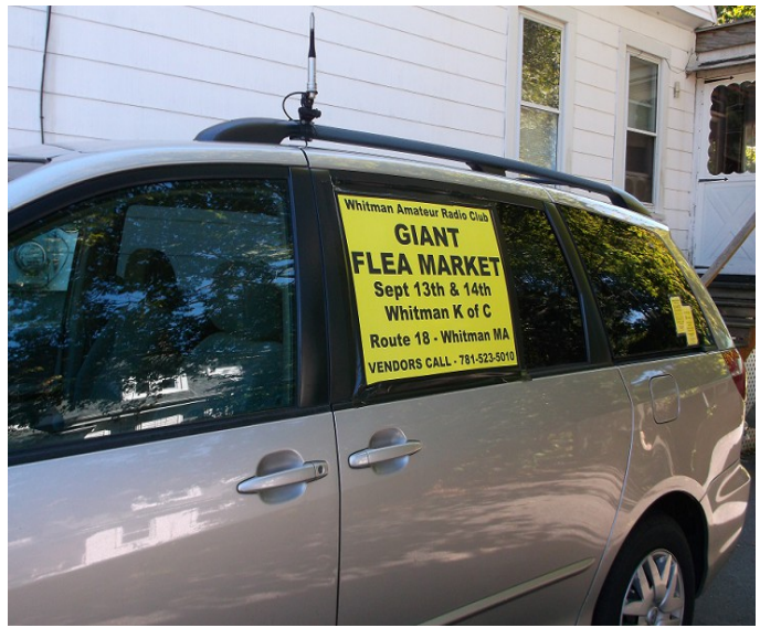
Jim W1JT provided the signs Bill N1FRE , rolling advertisement