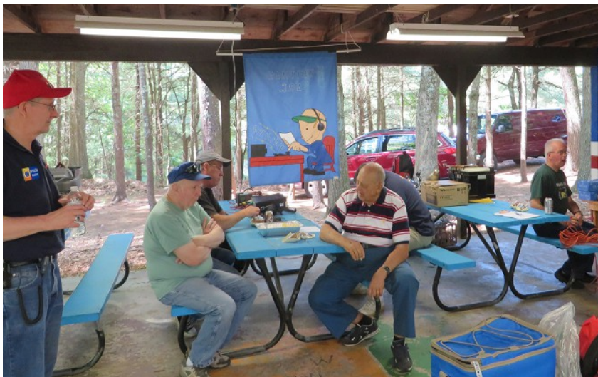
A fed crew is a happy crew!!