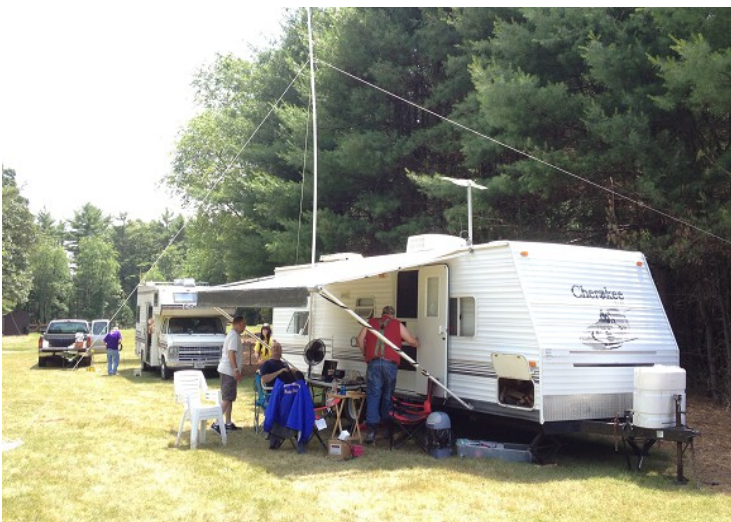
Also at mid-field Camp Tracy in the background (Jeff N1SOM and Bill N1SON).