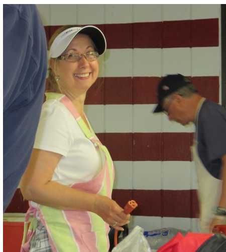
A successful and exhausting Field Day for sure!