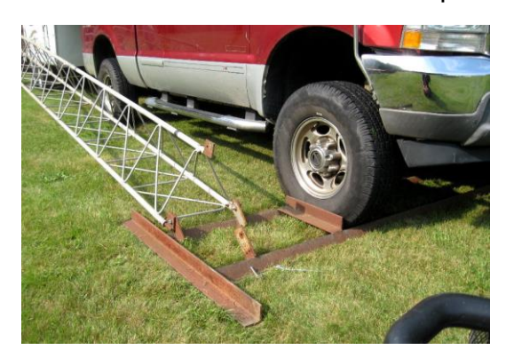
Hinged base and support frame

Jim Wolf N1JCW had been planning for Field Day for some time and had assembled a tower, rotor, and beam antenna. The hinged base is supported by a frame that is held down by the front tires of his truck and can be seen in the picture. The crew raised the 30 foot tower "Iwo Jima" style.