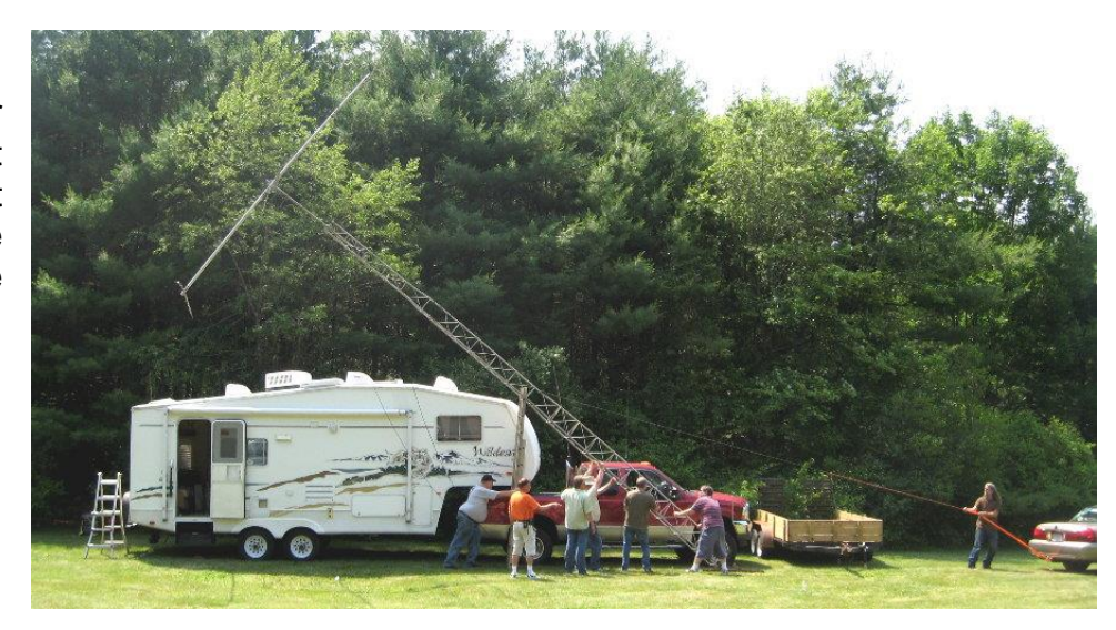
LOWERING THE TOWER: This photo gives you an idea of the height of the tower and size of the beam

10-Meters 26 15-Meters 10 20-Meter 394 20 CW 53 40-Meters 27 40 CW 188 80-meters 23