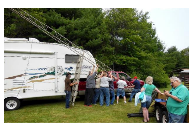
Raising the tower by hand