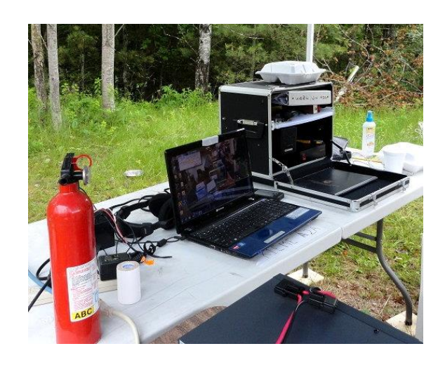
Rick's KB1TEE Go Kit

We had 5 different radio set ups. One for CW, one for data, and 3 for phone. We worked 2-Meters, 70-cm, 6-Meters, 10-Meters, and 20-Meters. Most of our contacts were on 20-Meters.