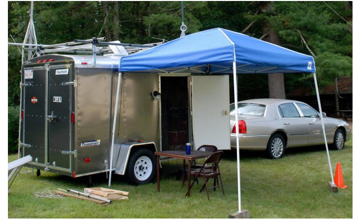
Brad's W1AY Utility Trailer

On Sunday, Brad W1AY shifted to 15-Meter phone to pick up a few more contacts. A total of 27 contacts were made on this 40-Meter Base Station along with six (6) 15-Meter contacts.