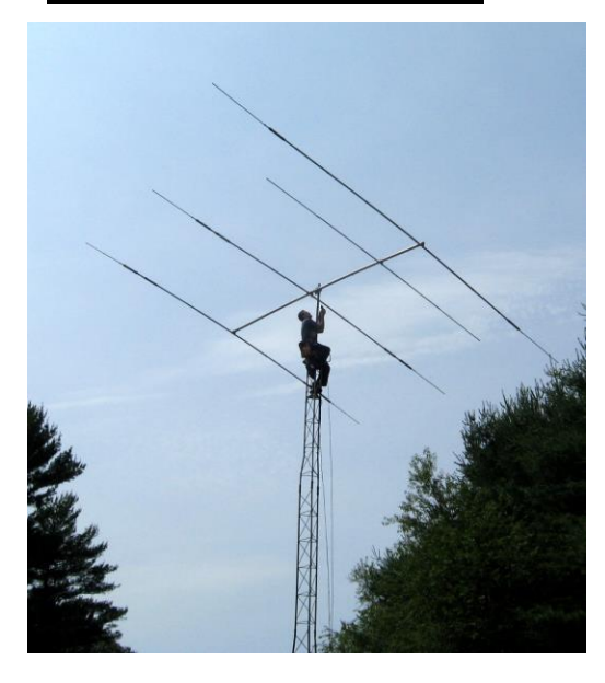
Eric Lowis SWL leveling the beam

Jim Wolf N1JCW set up his Yaesu FT-450 transceiver with a LDG tuner and 32 amp power supply. The set up was powered by Jim's N1JCW 3000 watt, inverter type, Honda generator with electric start (model EU-3000-is), The antenna is a Cushcraft A4S. A 4-element beam that is good for 10-15 & 20-Meters. The plan is to install the beam, along with the tower, at Jim's N1JCW house after Field Day.