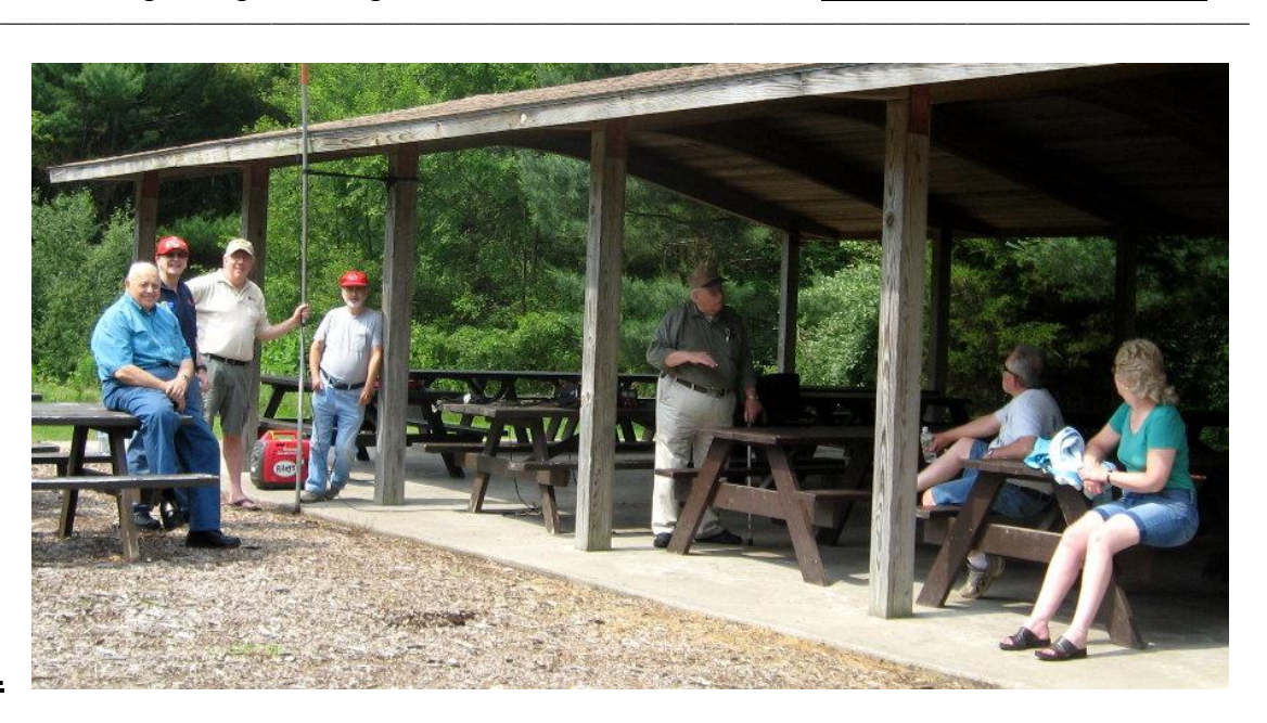
Lower Pavilion -- Saturday morning - set up crew