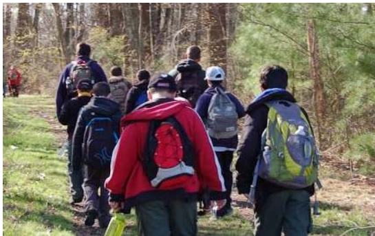
Some of the Scouts heading out to hide so that the dogs could find them.