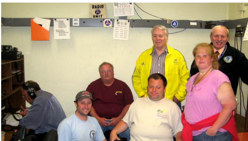
MEMA Region II Net Control volunteers

There are four Nets. There is the Sector 2A Net (Covering Bristol County) on the Dartmouth REPEATER at 7:30 p.m., the Sector 2B Net (Covering Plymouth County) on the Norwell REPEATER at 8:00 p.m., the Sector 2C Net (Covering the Cape and Islands) on the Dennis REPEATER at 8:00 p.m. and the Sector 2D Net on the Sharon REPEATER at 7:30 p.m.