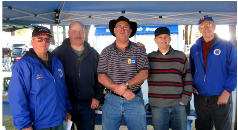
Gathered at the Whitman Club Booth on Saturday