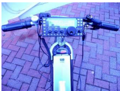
Elecraft KX3 transceiver