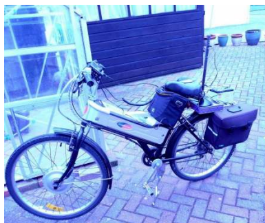
Mobile Electric Bike