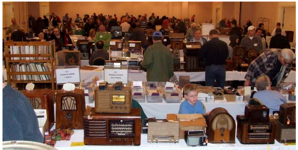
Floor consoles, Atwater Kent, Philco, and many more real radios that glow in the dark