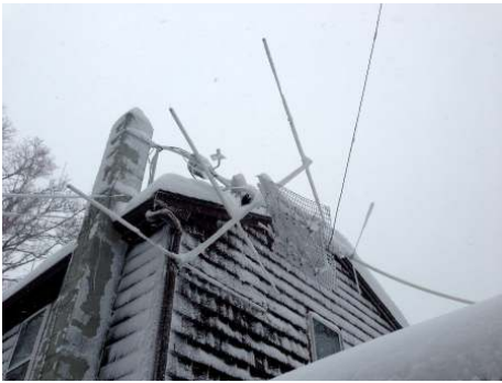
Jeff N1ZZN 6-Meter beam