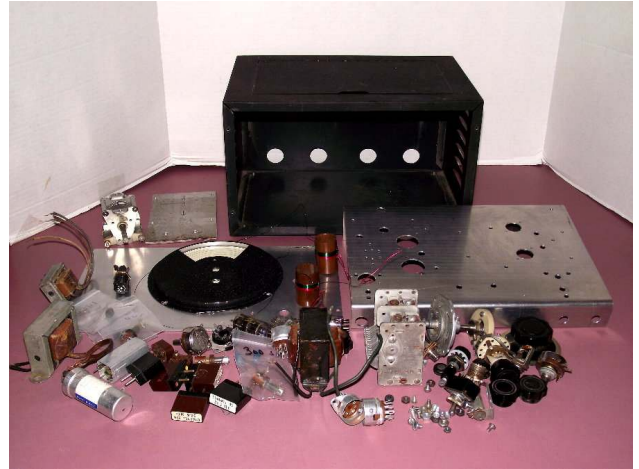
Phase one - assembling the parts

I had it all together for mechanical fit and looks pretty good. I stripped it down to polish the chassis and paint the front panel.