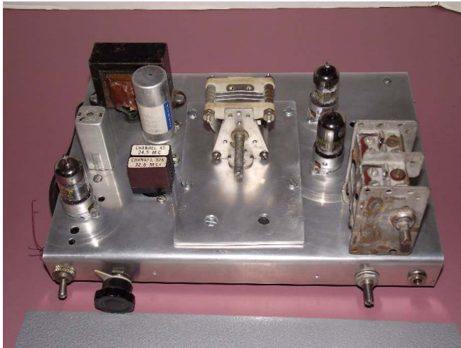
Phase two -- mounting the parts

PHASE TWO: I have most parts mounted on the Chassis as shown in the picture, the front panel painted and some wiring. I need to mount a couple more hand wound coils, then it is just wiring.