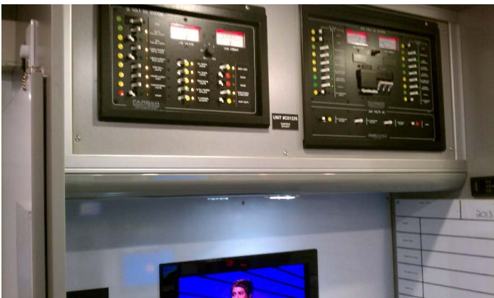
Power distribution panels