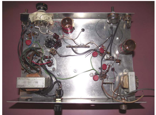
Phase three -- starting the wiring

PHASE TWO: I have most parts mounted on the Chassis as shown in the picture, the front panel painted and some wiring. I need to mount a couple more hand wound coils, then it is just wiring.