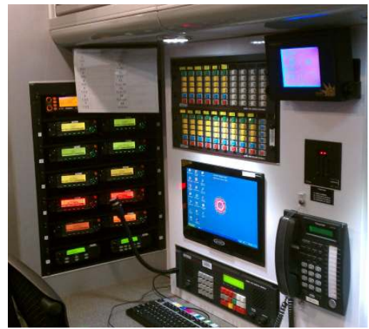
14 Radios (left) and patch panel (right)