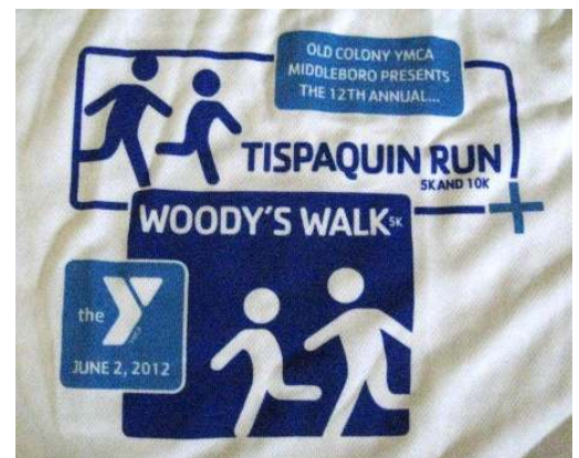
Tee Shirt - Front