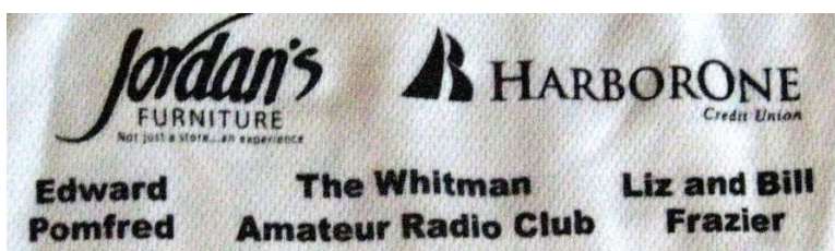
← Tee Shirt - Backside