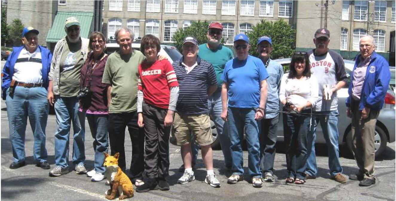
Sly the Fox