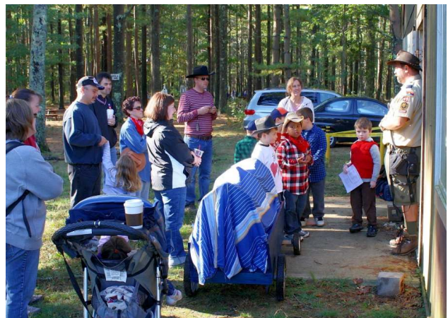
Don KB1LXH and the last of the 199 Scouts who were put On-The-Air