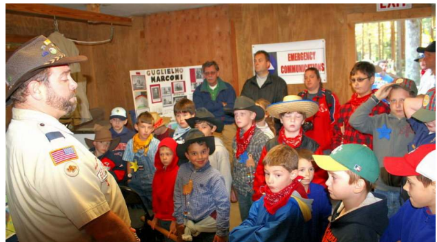
Don KB1LXH and more introductions