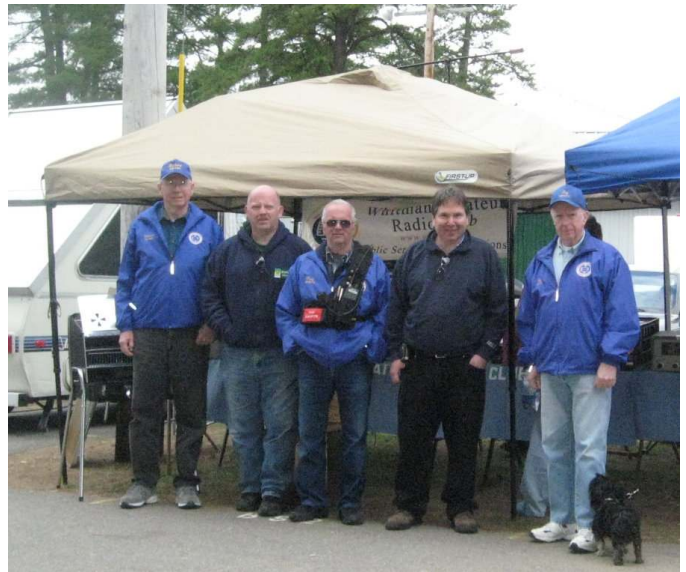
At the Whitman Club vendor table