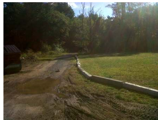
Looking into the Fox's Den

The photo shows the Fox's Den as it looked from the back of the school and ball field. The Fox vehicle is actually facing out behind a tree on the right side of the dirt road. The Bruce N11X spotted the headlights as Jeff N1ZZN was charging the battery in his vehicle.