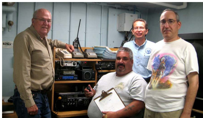
The Taunton RACES Volunteers

Next month, on August 2 nd , the Mass. Emergency Management Agency (MEMA) will be conducting a State wide Hurricane Drill between 7 – 9 p.m. in place of the normal RADIOGRAM Training. Listen in on the Norwell REPEATER 145.250 MHz PL 77.