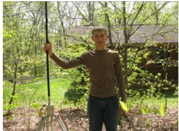
WARC club's Outbacker Outreach portable HF antenna with radials