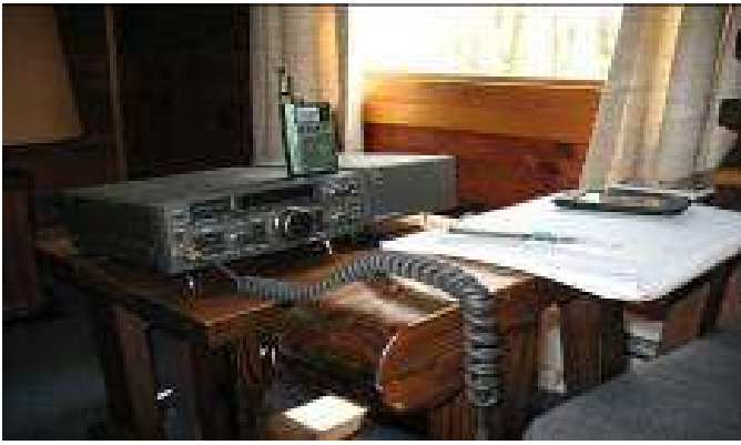
WARC club Kenwood TS-680