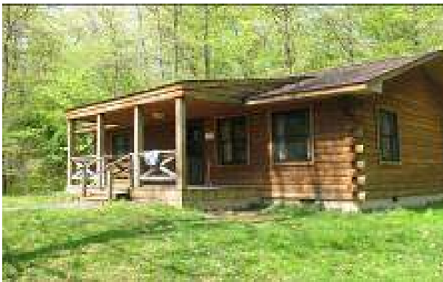
Pennsylvania cabin in French Creek State Park

It was a very enjoyable operation and I was glad that all my equipment functioned properly. Also in addition to making it a relaxing vacation, the rural location of the cabin insured that I was able to operate with a quiet noise floor all week!