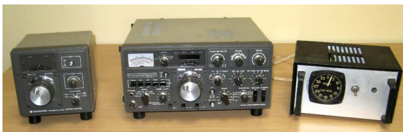
Kenwood TS-820 Transceiver