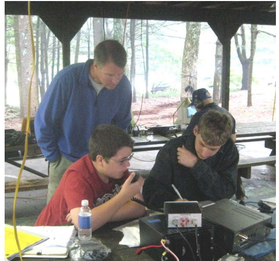
at the 15-Meter Base Station