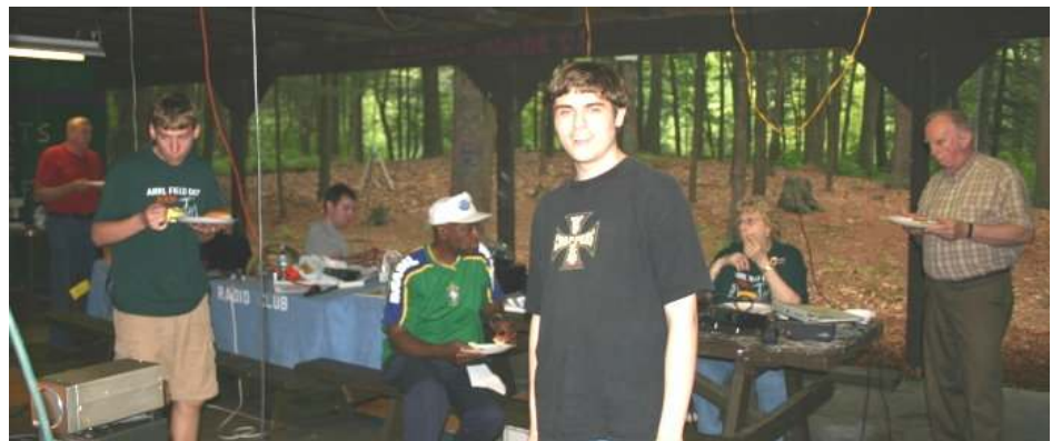
Some of the Saturday night Field Day 2009 Crew