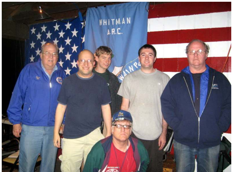
THE MIDNIGHT CREW