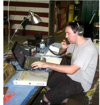
40-Meter Base Station operation

The Club members set up the Club's ICOM IC-756 Pro transceiver as a 40-Meter Base Station and connected it to The Bruce's N11X off center fed Windom antenna. This Base Station was using Jeff's N1ZZN personal computer with a Filed Day logging program installed. This Base Station made 200 contacts.