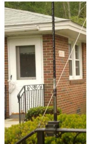
HAM Stick railing mounted