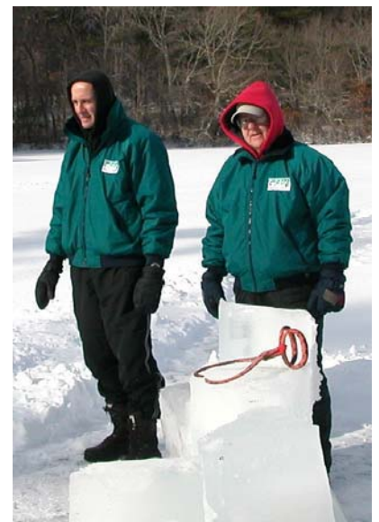
Whitman CERT Team