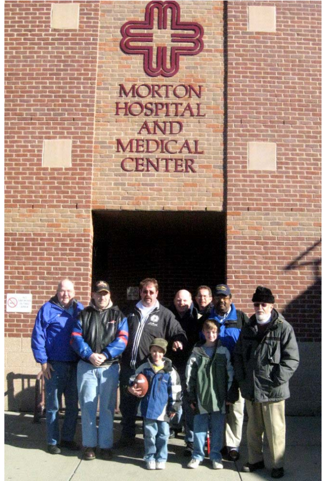
Taunton RACES Volunteers following the Hospital Drill

There was difficulty reaching one hospital in Fall River using the Bridgewater 2-Meter REPEATER and the Net Control switched to the Dartmouth 147.000 MHz (pl 67) REPEATER to pick them up. Other 2-Meter REPEATERS will be tested in the future. The Whitman and Plymouth REPEATERS were suggested.