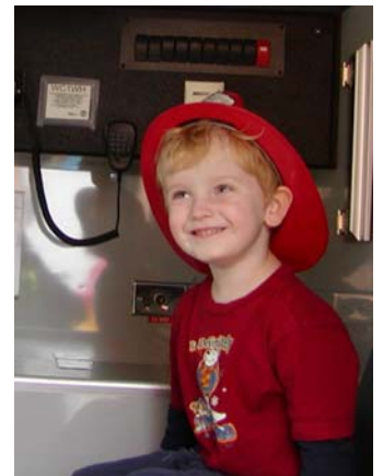
One of the happy kids