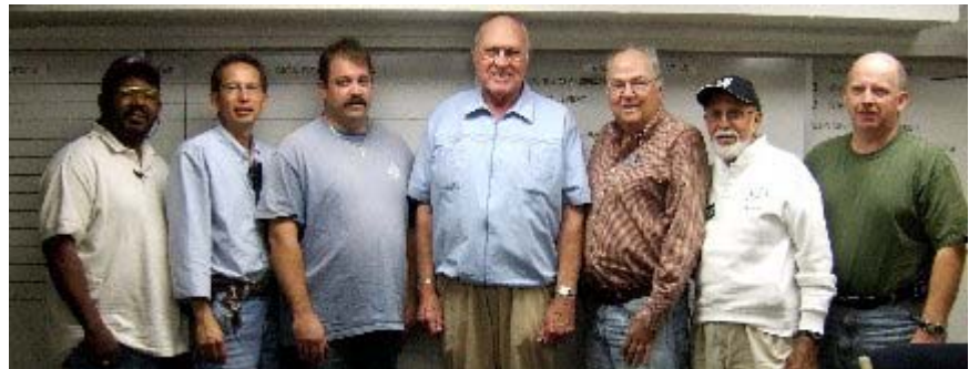
Taunton RACES Volunteers