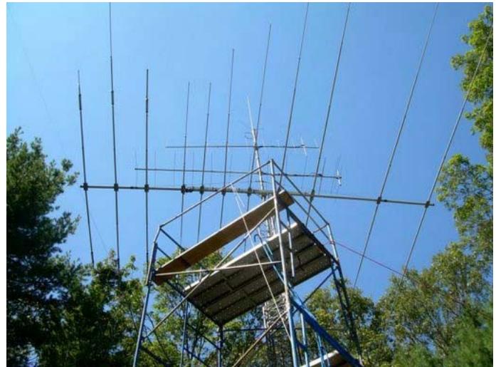
3 beam antennas and one vertical