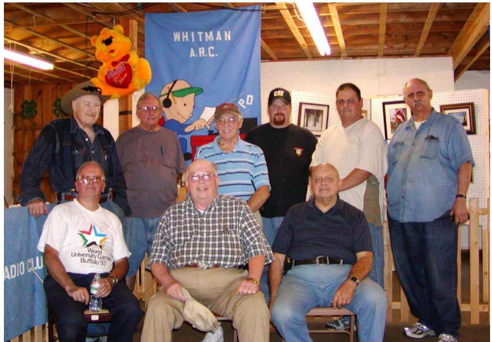
ANTENNA and SET-UP CREW