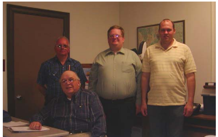
Whitman RACES Volunteers