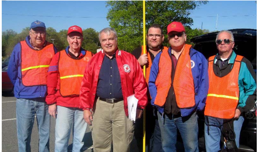
Whitman & Massasoit Club - Radio Team Volunteers