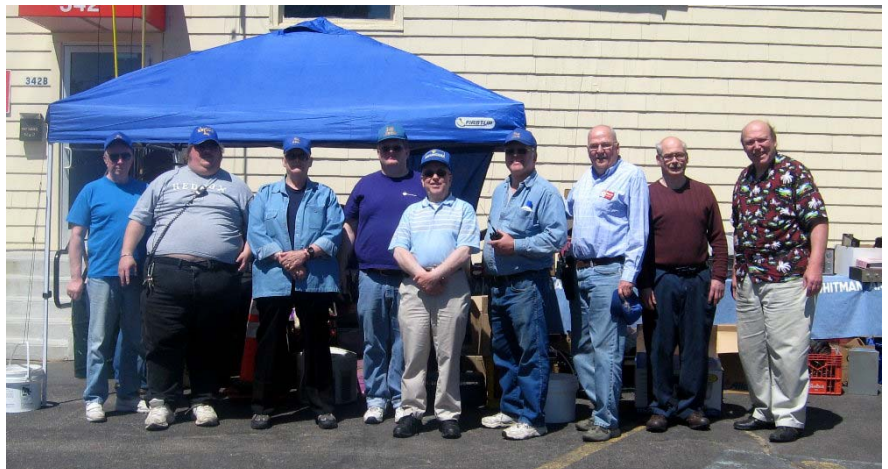
Some of the Saftler's Flea Market crew

See the Saftler's Flea Market Special Issue newsletter.