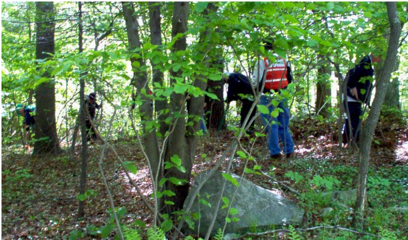
Search in progress