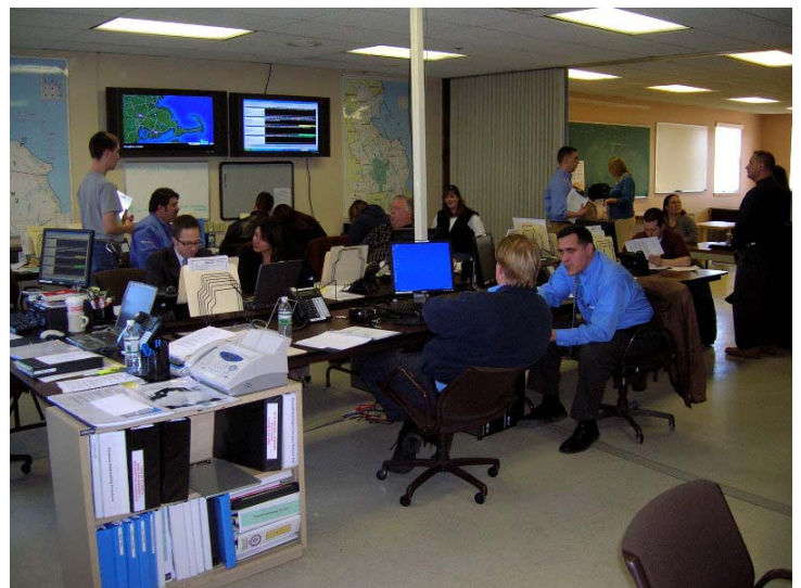
Plymouth Emergency Operations Center

Providing backup amateur radio communication at the Plymouth EOC