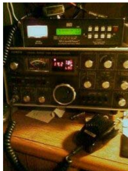
Tempo HF Rig and antenna tuner