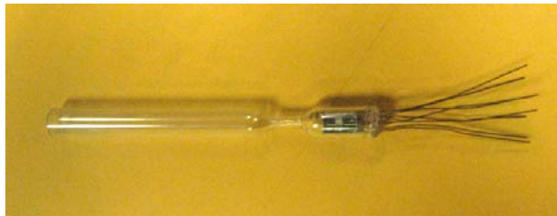
Tube under construction

We saw a glass tube under construction. The tube elements had been inserted in one end of a glass tube and sealed with the connecting wires protruding from the sealed end. The open end would be connected to a machine that either draw a vacuum or inserted an inert gas and then the smaller section of the tube would be heated up, sealed off and removed leaving a pointed tip.