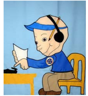
Sending NI1X an update

This is The Bruce NI1X - your SPECTRUM Editor - reporting on the radioactive updates I have received from the Whitman club members. This is your club and this newsletter is all about your radioactive adventures - send your updates to me at: bhayden@tmlp.com . Remember - If I do not get a picture - it did not happen.