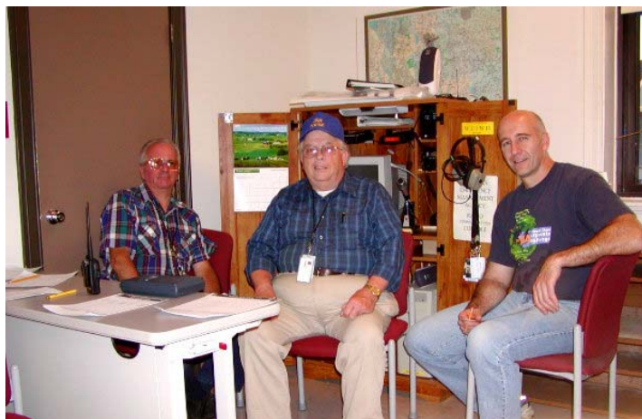
Whitman RACES Volunteers