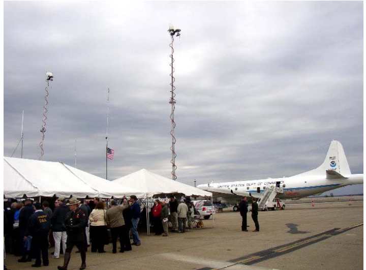
The theme was "Be Aware – Be Prepared" The American flag is on the Cushcraft R-5 antenna

The Governor of the State of Rhode Island was present and announced that the State of Rhode Island would follow up with a Hurricane Drill simulation that would flood streets and effect the coastline, causing need to prepare for the evacuation of 130,000 Rhode Islanders. This exercise would be designed to exhaust all the capacity of local Rhode Island manpower and mutual aid and test the Federal Government's ability to respond to the Request for emergency aid.