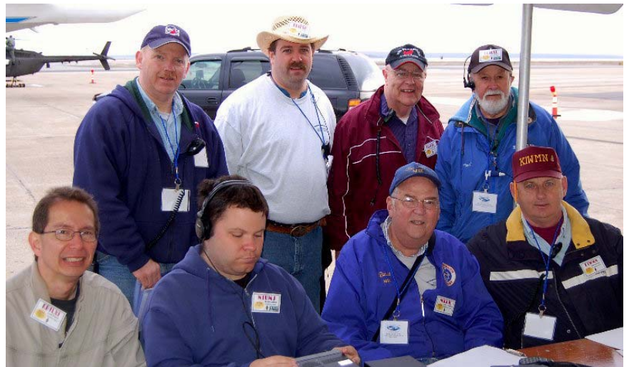
The TACGroup participants