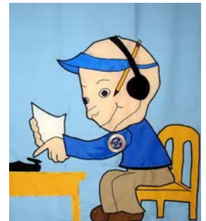
Sending WA1NPO an update