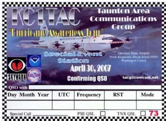
The TACGroup QSL card

It was a full day with Public Safety Officials touring the plane in the morning followed by Middle School kids in the mid morning and early afternoon and then the general public between 3 p.m. and 6 p.m. All were invited to tour the airplane and information tent where they could see displays and collect handouts that included Amateur Radio, Red Cross, National Weather Service, the Rhode Island Emergency Management Agency mobile command vehicle and much more.