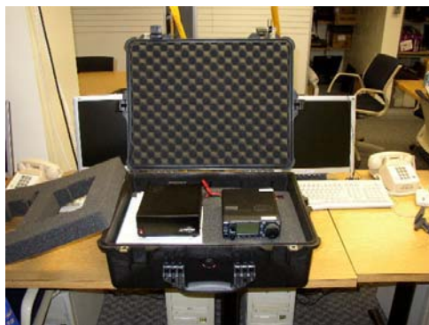
TEMA Go Kit

Red Cross Shelter work stations, including cots, were set up. Along with the amateur radio communication station, the operation of the Shelter Manager Office, Registration, First Aid, Mental Health Services, Food Prep and Food Serving Area, Snack Table, Sleeping Area and Recreation Area were explained. A mock drill was simulated on paper.