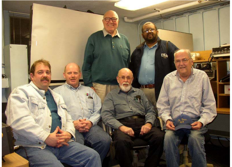
Taunton RACES Volunteers