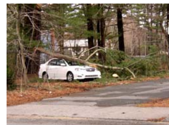
April Storm Damage