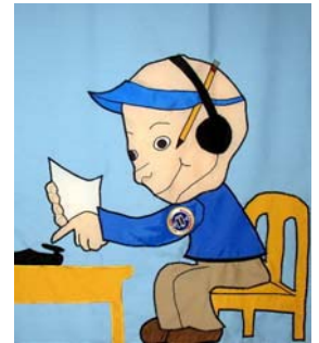
Checking in with WA1NPO