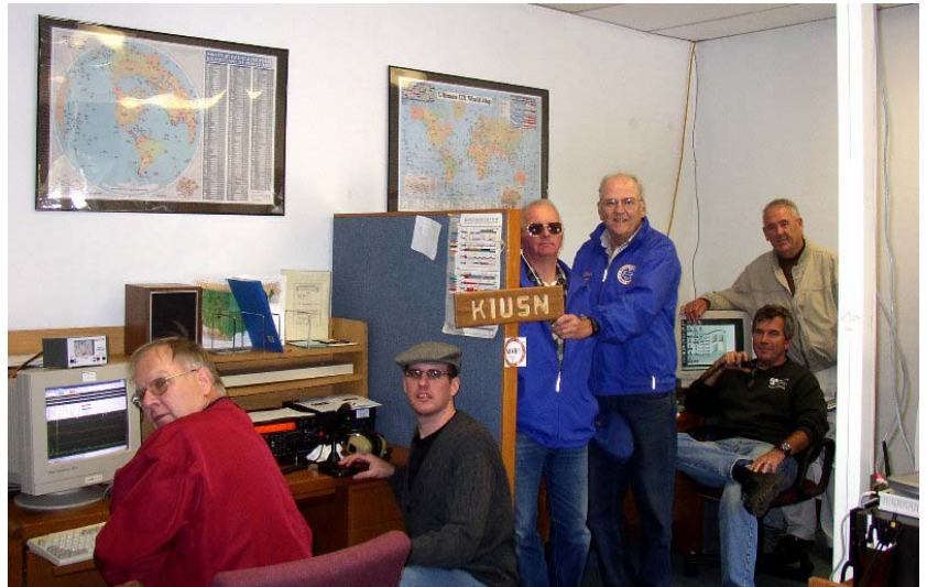
The K1USN Radio Room