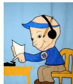
Checking in with WA1NPO

As part of our training, we encourage everyone to practice sending routine RADIOGRAM messages. In September we had four (4) sessions with an average of 9 area HAMS checking in each week and 7 messages were sent.