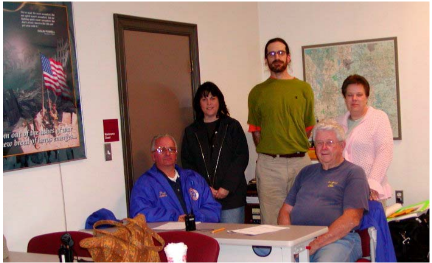
The Whitman RACES volunteers