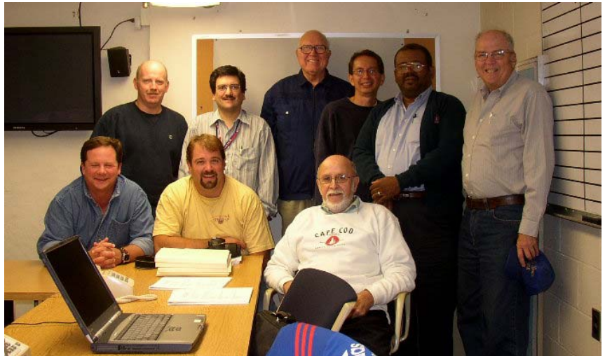
The Taunton RACES volunteers