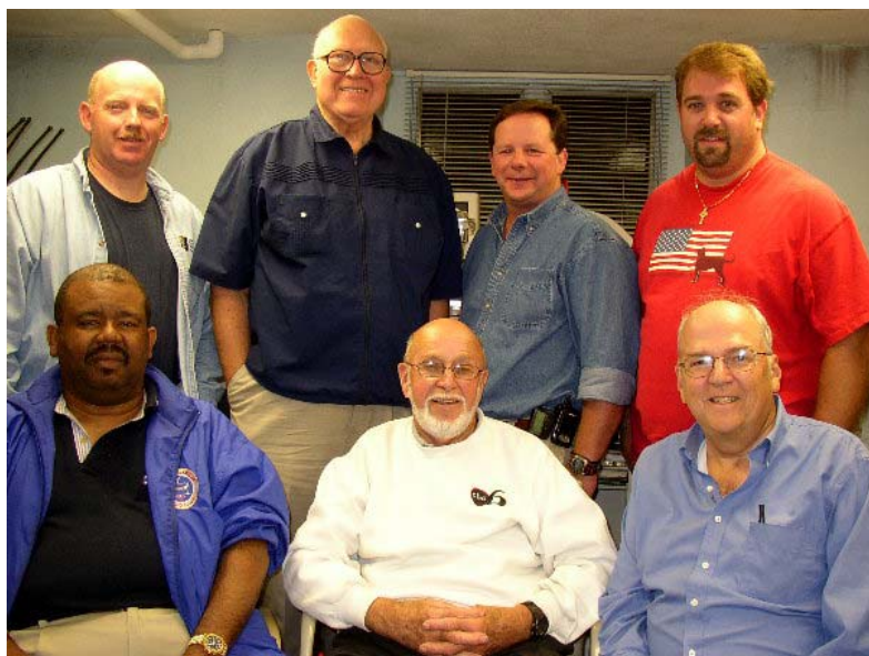
Taunton RACES Volunteers