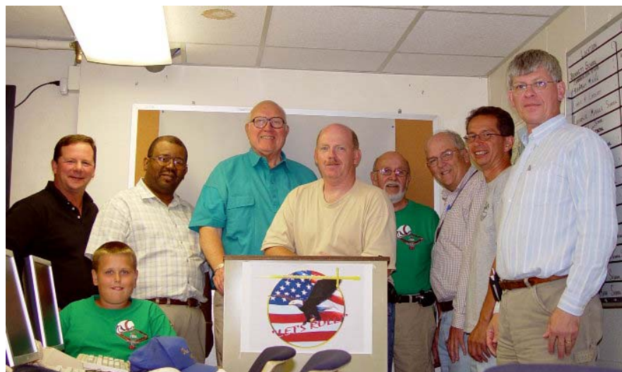
The Taunton RACES volunteers