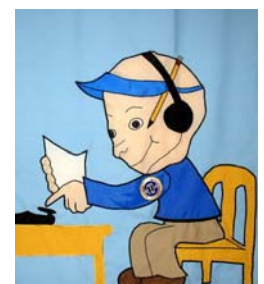
checking in with WA1NPO

As part of our training, we encourage everyone to practice sending routine RADIOGRAM messages. In April we had five (5) sessions with an average of 10 area HAMS checking in each week and 11 messages were sent.