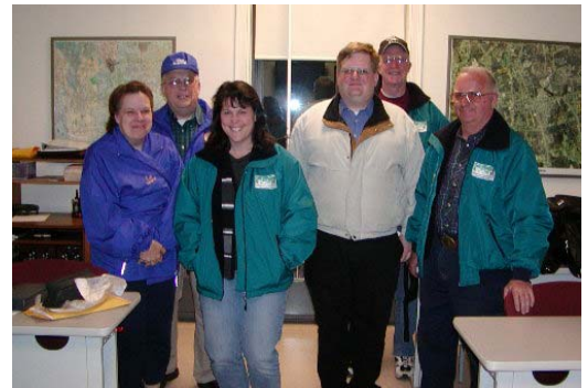
The Whitman RACES volunteers