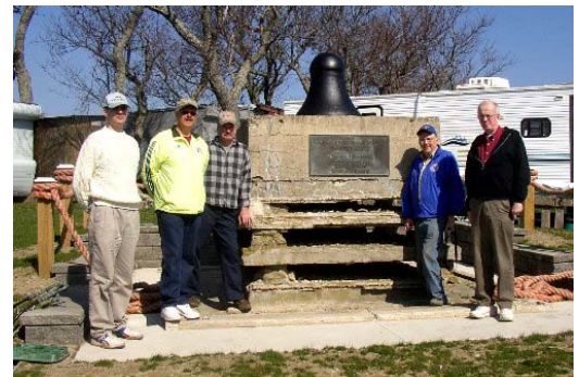
Fessenden Tower Site