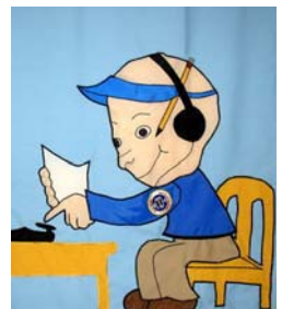
checking in with WA1NPO

As part of our training, we encourage everyone to practice sending routine RADIOGRAM messages. In March we had four (4) sessions with an average of 10 area HAMS checking in each week and 5 messages were sent.