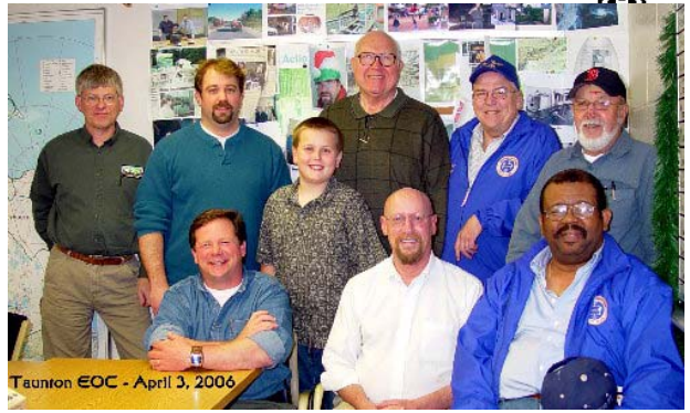
The Taunton RACES volunteers