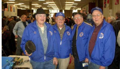
The Blue Crew