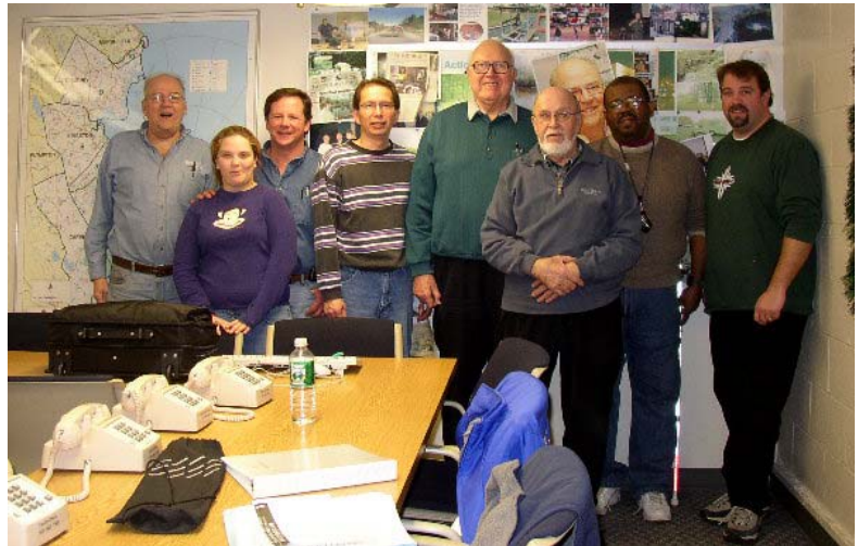
The Taunton RACES volunteer crew