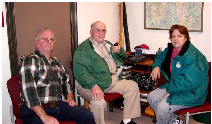
The Whitman RACES volunteer crew