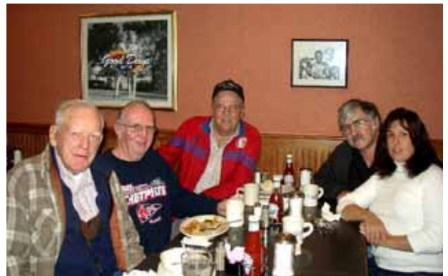
The Fox Hunters

The Fox transmits on 146.565 MHz for 30 seconds every 5 minutes between 10 a.m. and noon every Saturday morning. A good place to start hunting would be Fox Cove – Is that a hint or what ?