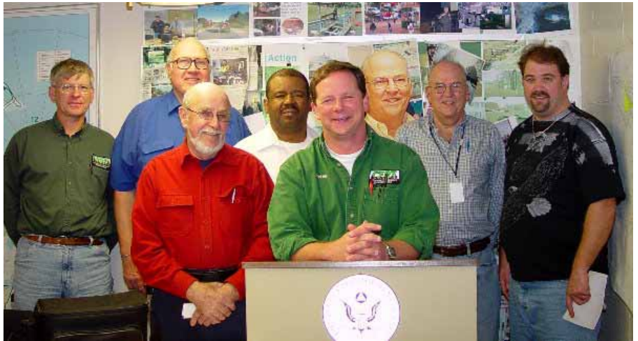
Taunton RADIOGRAM Training Crew