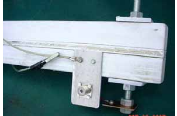
Jim O'Rourke WG1L

Jim WG1L pointed out several special features like the fact that the electrical parts are isolated away from the wood mounting frame by pvc pipe and plexiglass material. A ground strap is connected to the truck bumper and a whip antenna with a 40-meter loading coil is attached to the top of 15 feet of electrical conduit. A small jumper at the top is used to adjust the SWR between the CW and SSB portion of the band. For further information, contact Jim WG1L at wg1l2001@yahoo.com