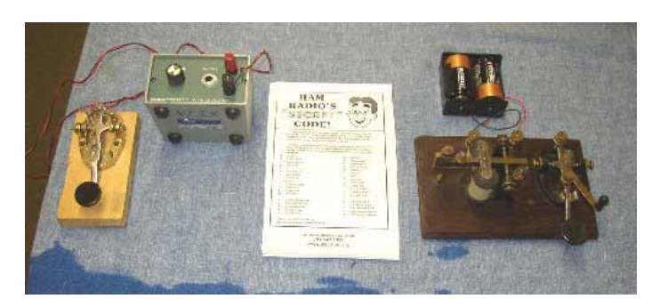
Code Practice Oscillator --- Telegraph Sounder