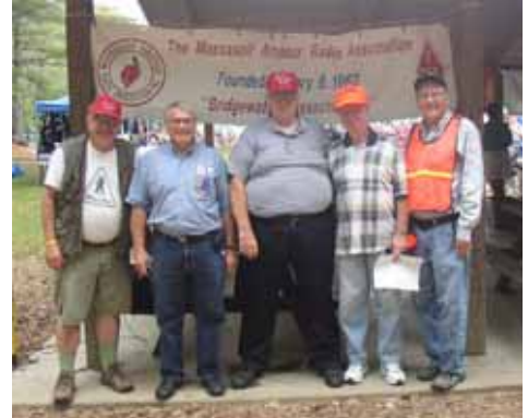
More of the Motley Crew