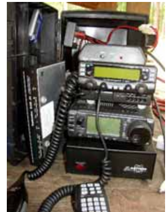
Go-Kit Radios In A Box

After the event the Radios In A Box Go-Kit was pulled apart and a ROOT CAUSE ANALYSIS of the problem was initiated. Each transceiver has a short coax cable that extends outside of the box and it looks like the one barrel connector present was left on the HF rig following Field Day. If the 2-Meter antenna was connected to the HF rig and the 2-Meter rig was operating with a 30-inch coax cable for an antenna - that would explain the poor performance of the 2-Meter rig. Actually it was remarkable that there was no smoke and that the exposed end of the coax cable was able to pick up the Bridgewater REPEATER from South Middleboro. Great fun being a rocket scientist – I mean a Monday morning quarterback.