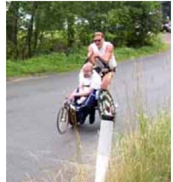
The Hoyt Team

The Hoyt team of Boston Marathon fame were participating. I was told that Richard Hoyt towed his son on a raft for the swim portion, then came past my position several times on a tandem bike and finally came by my position with Richard pushing the wheelchair we have seen so many times at the Boston Marathon. Their time - 3 hours and 3 minutes.