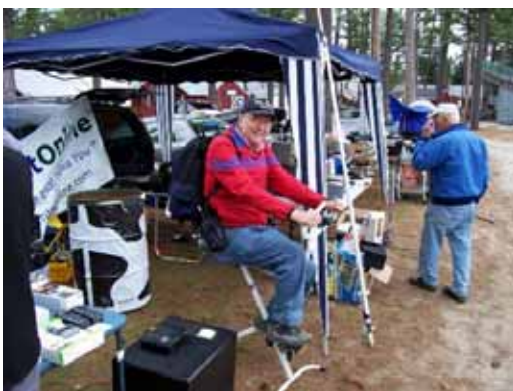
The Bruce N11X

The Bruce N11X is shown taking a stationary bike for a test run at Hosstraders but with no generator attached and no cup holder - not good enough. If all goes as planned, The Bruce N11X will soon be heard Stationary Bicycle Mobile from his home QTH - no more getting up early to hit the gym three times a week.