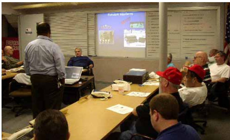
ECHOLINK PRESENTATION AT THE MASSASOIT CLUB IN APRIL