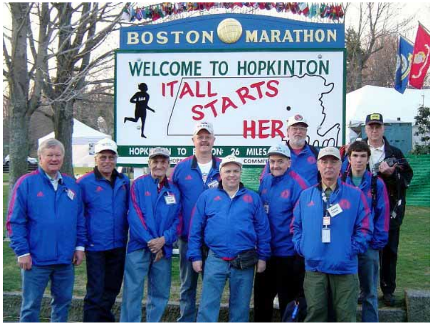
Area HAMS at the Hopkinton Starting Line