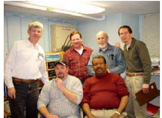
The Taunton Crew