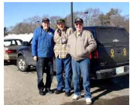
The Fox Hunting Crew

If you can get free on a Saturday morning - give the Fox Hunters a call on the Bridgewater Repeater 147.180 MHz and come join in the hunt. The Fox transmits on 146.565 MHz for 30 seconds every five (5) minutes between 10 am and noon.