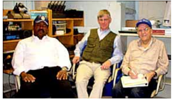
Taunton Radiogram Training Crew

Radiogram training takes place on the first Monday of the month at 7:30 PM on the Taunton REPEATER 147.135 MHz tone 67 Hz for Bristol county or at 8:00 PM on the Norwell REPEATER 145.250 MHz tone 77 Hz for Plymouth county. Three messages were sent by the Massachusetts Emergency Management Agency Region II headquarters to all the Emergency Management Directors in the local Cities and Towns in January.