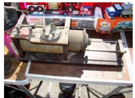
Antique Crystal Radio

THE BUY OF THE DAY: There sitting on one of the vendor tables, among a bunch of household items, was a 1910-1920 Crystal radio shown in the photo. The Bruce N1IX bid $50.00 and was told later that the antique crystal radio went for $90.00 which was probably still half price. One tapped coil slid inside the other on what looked like brass rods. There was a Cat Whisker Crystal mounted on the top right and what looked like a paper capacitor mounted on the top left. And then the Flea Market was over.