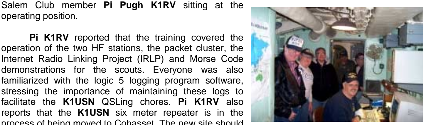
CREW AT THE USS SALEM

Pi K1RV reported that the training covered the operation of the two HF stations, the packet cluster, the Internet Radio Linking Project (IRLP) and Morse Code demonstrations for the scouts. Everyone was also familiarized with the logic 5 logging program software, stressing the importance of maintaining these logs to facilitate the K1USN QSLing chores. Pi K1RV also reports that the K1USN six meter repeater is in the process of being moved to Cohasset. The new site should greatly improve the 6 meter coverage.