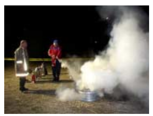
The Bruce NI1X in action

The April CERT classes covered Disaster Preparedness, Fire Safety and Disaster Medical Operations. The participants were encouraged to practice a fire evacuation drill with their family at home. Some participants, like "The Bruce" NI1X in the photo, got to use a fire extinguisher for the first time. Other good ideas were to establish one designated out of State contact person for your family members to contact in the case of a local disaster. Personal safety was stressed and liability issues were discussed. Go-Kits were an interesting topic ranging from a 72 hour personal kit to 5-6 day home and workplace disaster supply kits. When disaster strikes (such as an earthquake in California, where this CERT training got it's start) you may find yourself in the position to be a first responder for your family,