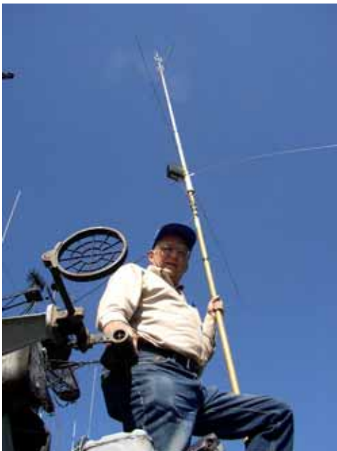
The Bruce NI1X

The Bruce NI1X is shown after he had set up a temporary Cushcraft R-5 vertical antenna onboard the USS Salem to give the USS Salem crew K1USN a third HF operating position.