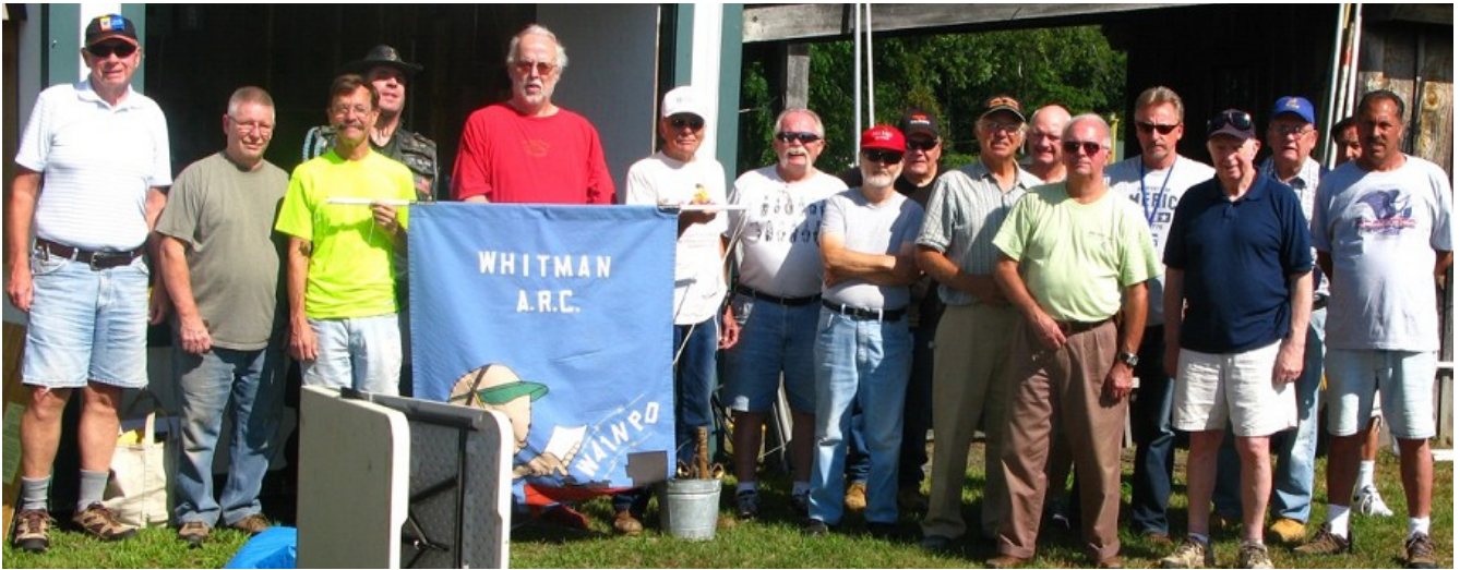
The Setup Crew