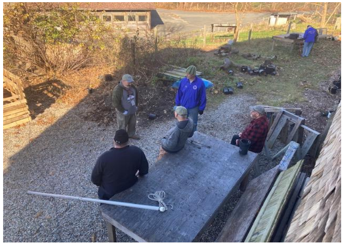
Installing the Antennas at the Horticulture Building