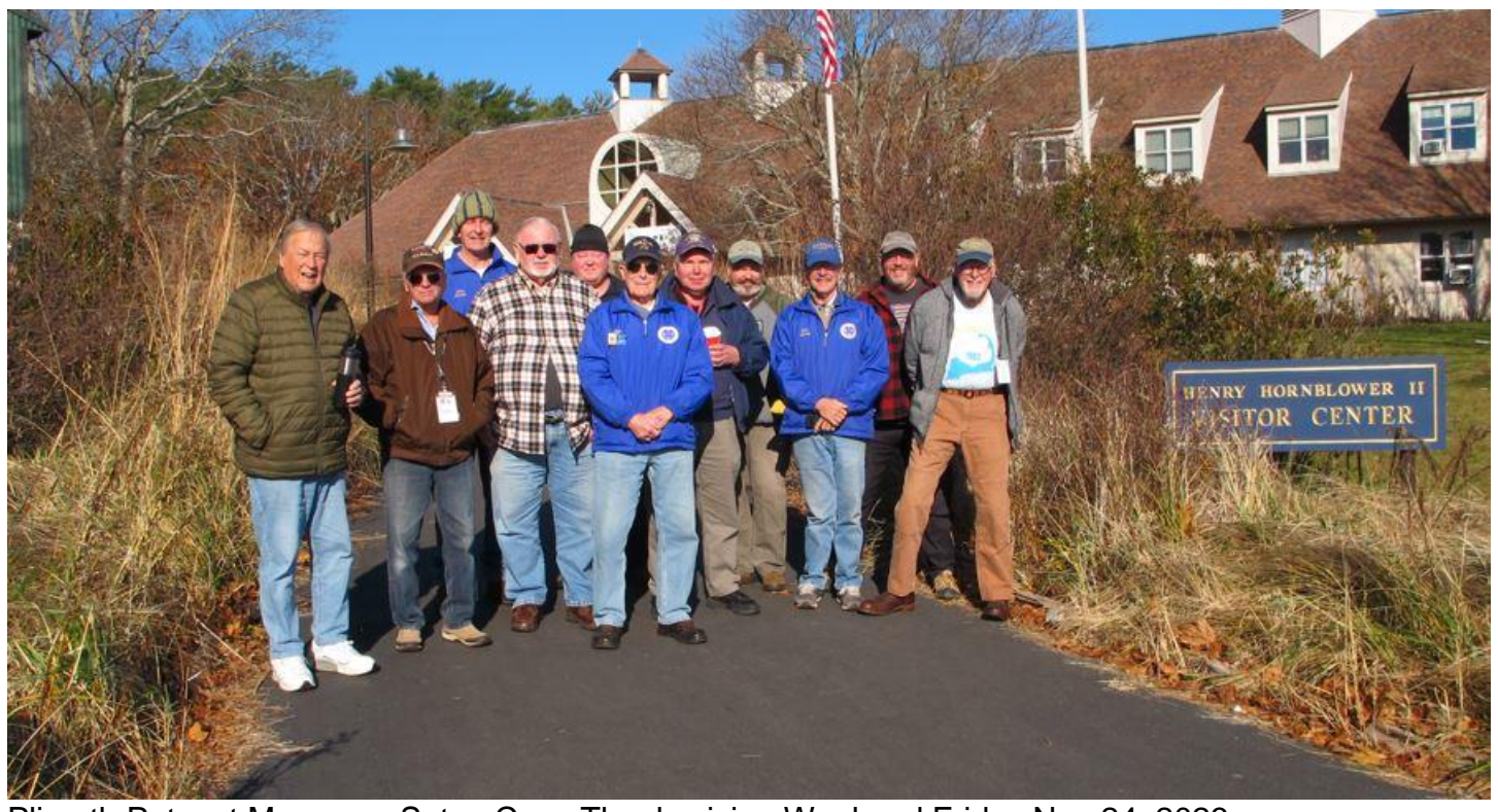
Plimoth Patuxet Museums Setup Crew Thanksgiving Weekend Friday Nov 24, 2023