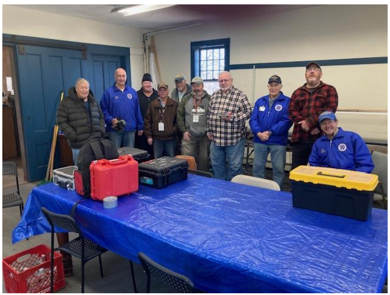
Setup crew in the Horticulture building