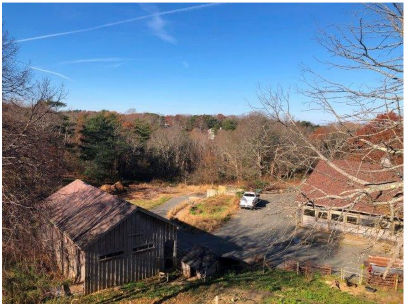
View from the Horticulture Building,.