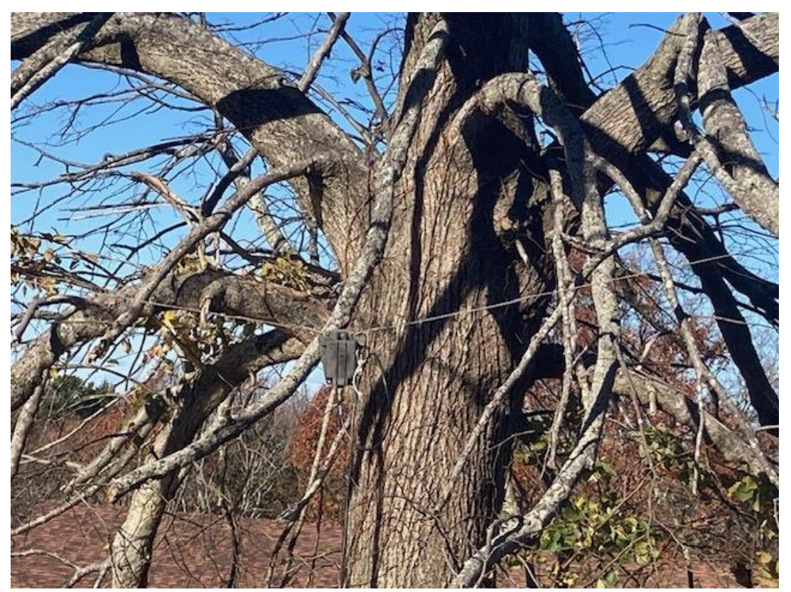
The Windom in a tree Worked great